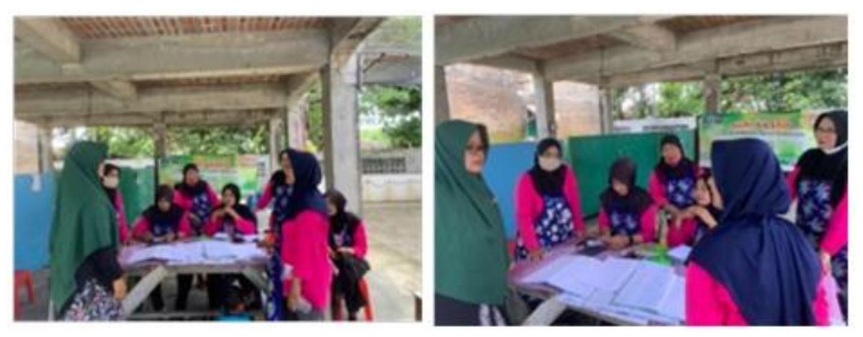
Figure 4. Ask Answer and Discussion

During the implementation of the activity, an evaluation is carried out which includes pre-test and post test through question and answer and discussion both before training and mentoring (figure 4) as well as direct observation of mastery of the practice as shown in figure 5.