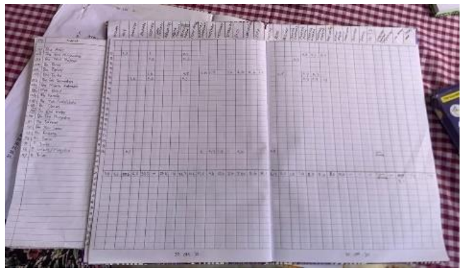
Figure 1. Manual Record Keeping.

4. Financial administration and bookkeeping that is done manually makes financial reporting not accurately reflected and vulnerable to loss as shown in figure 1.