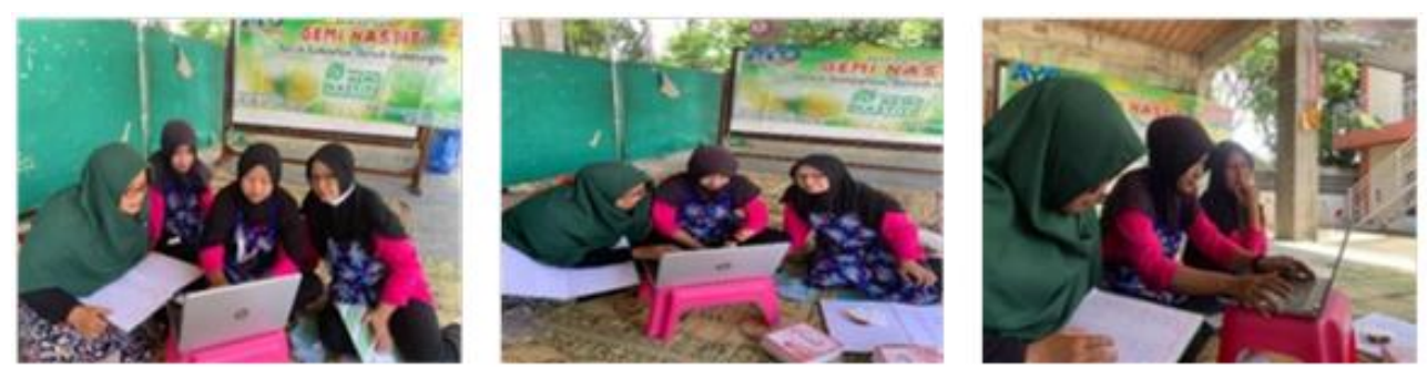
Figure 5. Training and Assistance in The Use of Microsoft Excel Applications