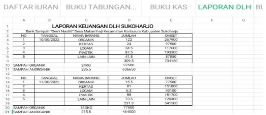
Figure 8. Financial Statement Worksheet

The results of recording financial statements through Microsoft Excel can later be used for accountability reporting to all members of the "Gemi Nastiti" Waste Bank as well as to the village and DLH (Environmental Agency) Sukoharjo to be used as a reference or reference in the development of village waste banks. This reporting is also used to apply for operational funding assistance to the village and to members for an increase in monthly dues because the funds obtained from member dues and the proceeds from the sale of waste are still insufficient to meet the operational costs of the waste bank.