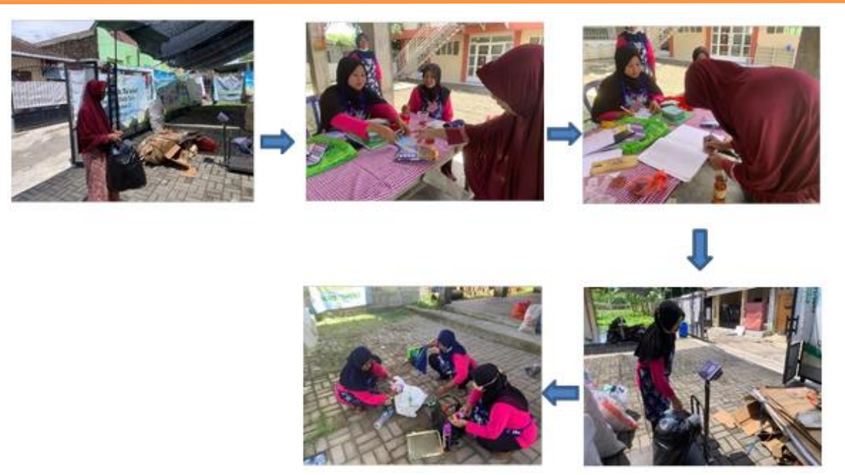
Figure 3. Flow of Activities of Waste Bank Members Selling Their Waste.

During the implementation of the activity, an evaluation is carried out which includes pre-test and post test through question and answer and discussion both before training and mentoring (figure 4) as well as direct observation of mastery of the practice as shown in figure 5.