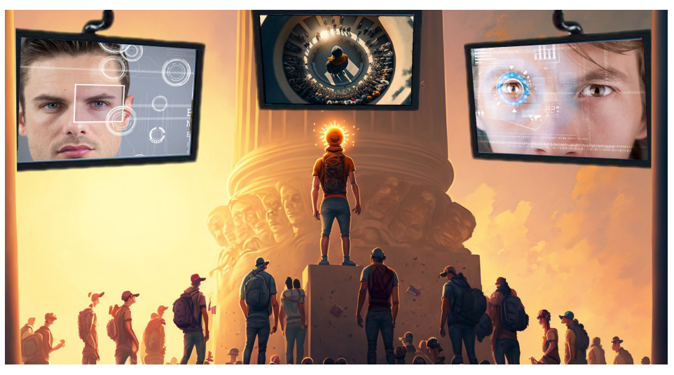
Figure 2 Raised Pillar

Our first suggestion is to have users viscerally confront the meaning of their eyes being tracked in the privacy training module described previously. In a potential immersive VR privacy module, users might find themselves standing on a pillar raised hundreds of feet. Beneath them, a crowd of people are looking at them, and before them are large TV screens, suspended in the air which are all recording and playing the users' current movements. After a short interval of this disorientating experience, the screen could present to the user relevant data and analytics concerning the scenario in the privacy module.