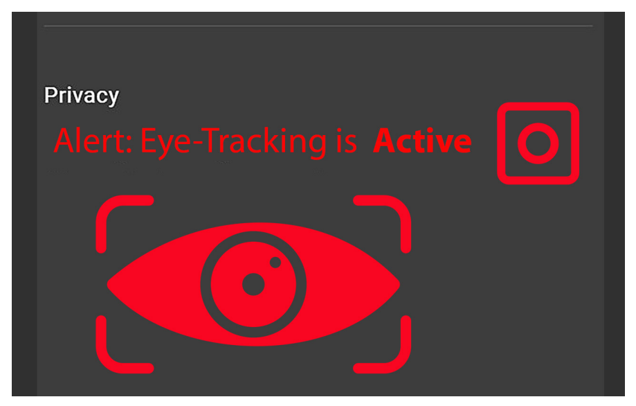
Figure 4 Alert: Eye-Tracking is Active

We can apply the same idea to privacy with eye-tracking by capitalizing on users' familiarity with previous indicators that prime them to privacy-awareness to encourage them to be more conscious and careful with immersive VR technology. Basically, users must grasp that their behaviour is being surveilled and data-mined. One way to do this is to leverage a helpful design feature that became popular during the pandemic. The video conferencing platform Zoom provides an audio alert that announces "recording in progress," adding the visual element of a pulsing red circle next to "Recording…" The notice is attention-grabbing for two reasons. It is multi-sensory (and thus more accessible than one that only stimulates one sense). Additionally, the circle evokes the recording feature on Apple's "voice memos," and the dot is reminiscent of the one signifying that the camera feature is enabled. In VR, similar elements could be adapted to say something like "Surveillance and Data Mining in Process."