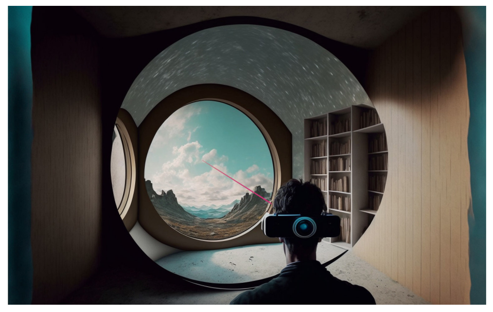
Figure 6 Coloured Tendrils

(henceforth, FBA).<sup>78</sup> FBA is "the selective processing of a relevant feature over unattended feature," and in this case, the focal features are items like colours and motions.<sup>79</sup> While psychologists find that correctly employed FBA can improve people's ability to understand and retain information, additional research should be done to determine its efficacy in this context. Furthermore, our eye-tracking design suggestions should be taken as conjectural ideas to consider implementing. As Calo notes, visceral notice suggestions require interdisciplinary empirical experimentation to validate.