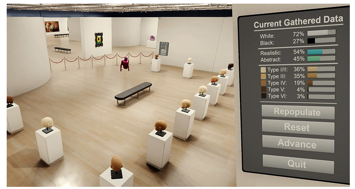
Figure 3 Art Gallery

Designers can further tweak the scenario so that it aligns more directly with Calo's loan example – an example that renders salient a harm that unfolds over time. Consider one of the most challenging privacy issues: helping individuals understand that individual actions can have profound long-term societal impacts. To illustrate this point through showing, users could re-enter the art exhibition after being presented with the initial core eye-tracking information. Now, the virtual space will have changed. If users previously looked more at figurative than abstract art, this time, only figurative art will be displayed. Or, if users looked more at light-skinned than dark-skinned sculptures, only light-skinned ones are displayed. Having had a chance to explore the updated environment, users are presented with an explanation for the change: the gallery has been altered to showcase seemingly preferential content. The experience could prompt the user to think critically about whether it is a good idea to engage in activities that exacerbate the influence of bias and lead to virtual worlds having less diversity.