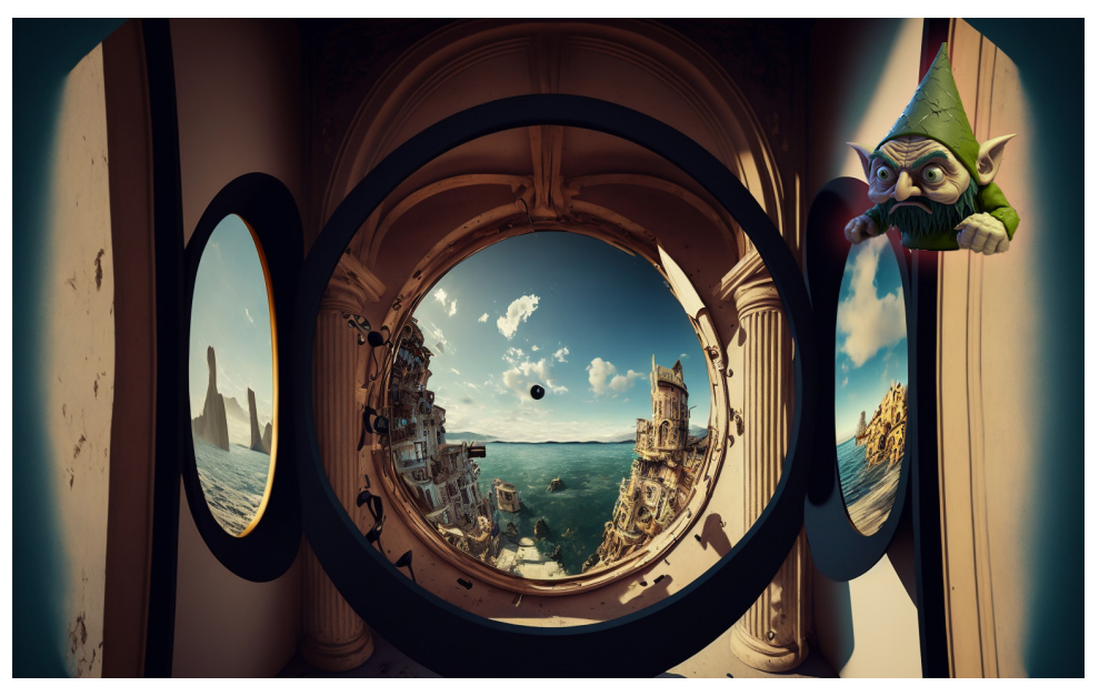
Figure 5 Creepy Gnome

One anthropomorphic cue that Calo suggests is to have a little avatar run across the screen when they click on new websites.<sup>74</sup> Since seeing a physical manifestation of being followed is presumably uncomfortable, it can help the user to become more viscerally aware of tracking and take it more seriously than if the notice was a wall of boring text. For another example, imagine a little green gnomish figure tucked into the top right-hand corner of a computer screen. It has bulging eyes (to signify eye-tracking), and stares intensely at users, always meeting their gaze directly. It might also occasionally blink or tap the foot slightly to attract users' attention. Being continually looked at by an anthropomorphic figure like the gnome can trigger our psychological discomfort – a sense of creepiness.<sup>75</sup>