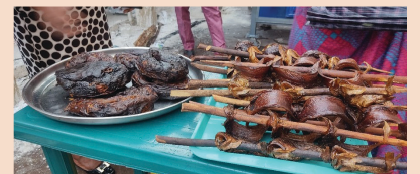
Top to bottom: Tabletop prototype model of the modernized fish dryer; life-sized and fully functional fish dryer prototype, which is only one quarter of the intended modern fish dryer design; fish dried using the life-sized fish dryer prototype.