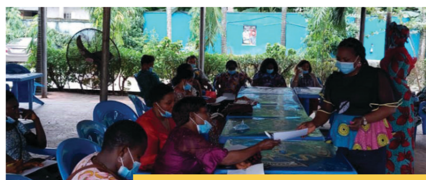
Focus group discussion in Eket senatorial district