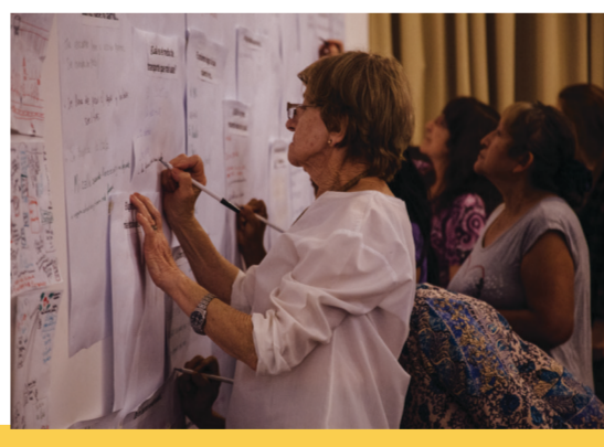
Images left to right: Various images from workshops with women from Alberdi, Villa Páez, and Marechal mapping their daily routes and care services in their area.