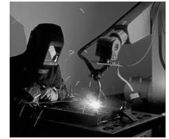
Figure 1: An example of the H - R interaction where a real-time human control of robot welding is presented

each innovative component should be integrated into the system so that it does not pose a possible cause of errors in various conditions of use of robots and for different tasks.