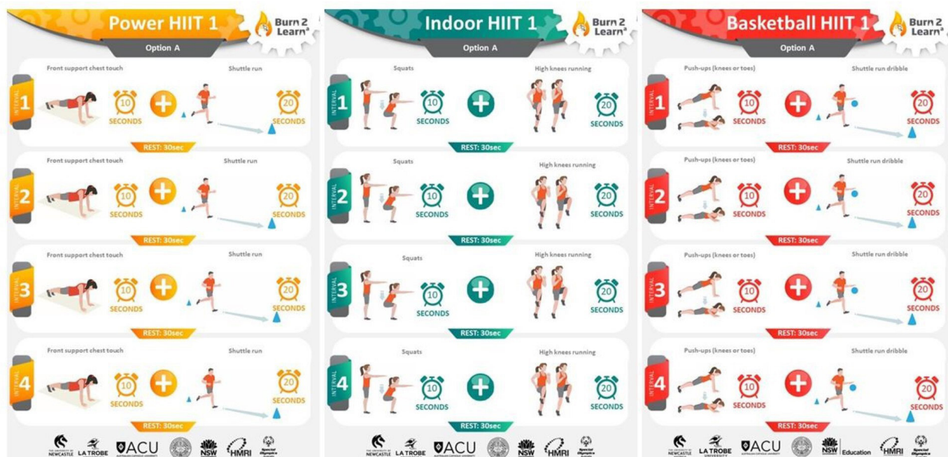
Figure 2 Examples of B2La HIIT session cards. This figure was created by the lead investigator.

17 onwards), students will be encouraged to engage in physical activity sessions of interest outside of school (eg, at home, the park), but teachers may continue to facilitate B2La sessions during lessons if they choose. Students will have their own B2La goal setting activity booklet.