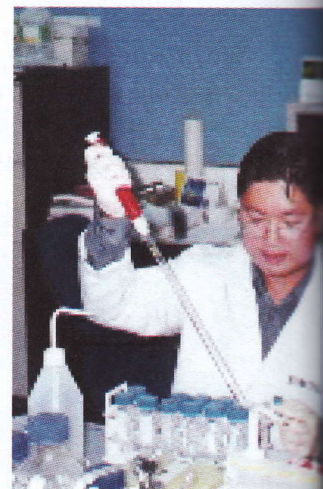
Molecular lab work at E Campus (old campus) lab (2000).

The tutorship and the years following it brought many precious, unforgettable moments. One of those was my participation in the research expedition to Bario, the Kelabit Highlands. This was the first ever wildlife expedition for me. It was the rite of passage that turned a boy to a man. More than a simple eye-opener, the Bario experience was a steep learning curve for a "lab rat". The flight to Bario from Marudi in a twin engine 12-seater turboprop airplane in itself was unbelievable. It was amazing how such a small plane could get researchers there and back, taking off and landing on a grass runway strip. This was a big deal for any city boy.