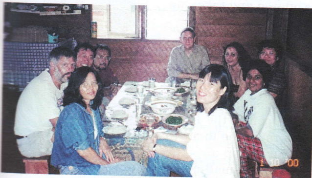
Lunch at the Labang Longhouse, Bario.

We headed to the Labang Longhouse Lodge. Surprisingly, the thinness of the mattress, the freezing cold showers, and the lack of basic infrastructure did not bother me at all. The hospitality of the Bario community and the friendliness of the team filled the humble wooden abode with a warm and welcoming atmosphere. It made our accommodation a cosy and comfortable place to stay.