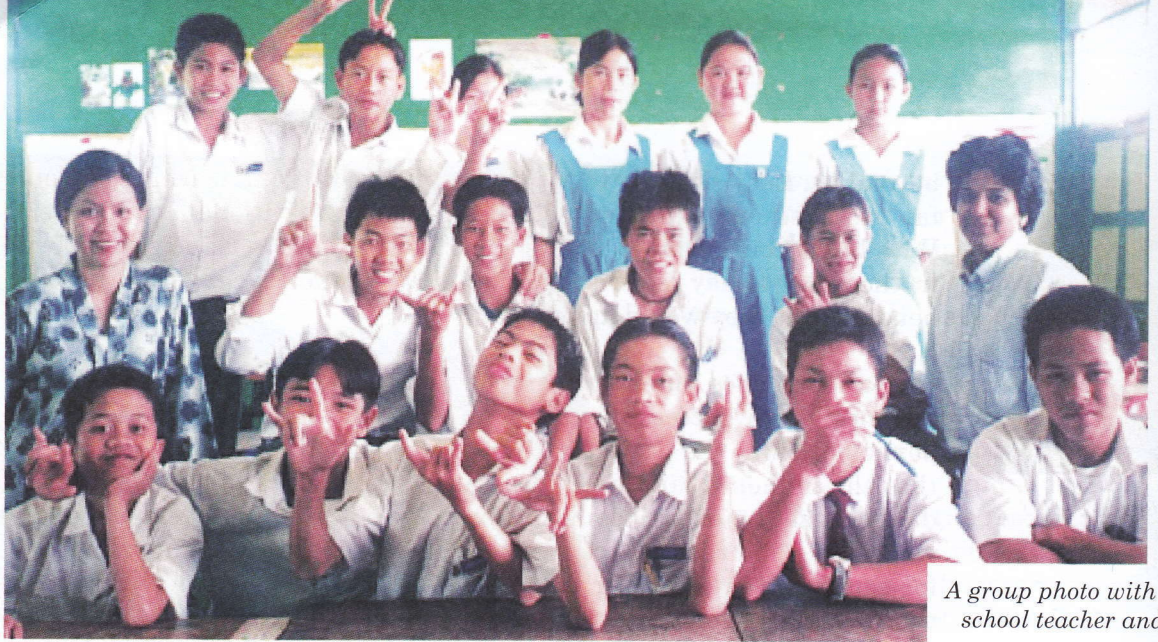
A group photo with SMK Bario school teacher and students.

The following year, I made my second trip to Bario with Compserv staff, this time, to set up the Pentium 5s in the Bario Primary School (SK Bario). As we were setting up the PCs, curious school children peeped through the 'actual' windows of the wooden block. No words can describe the children's anxiety and excitement when they were given the opportunity to 'play' with the PCs – I wish I had taken a snapshot to capture that moment. Nonetheless, the image is still fresh in my memory.