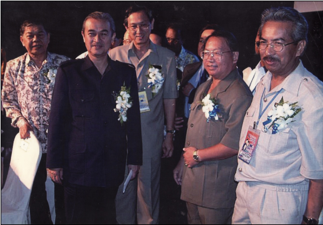
Picture 3: Abdullah Ahmad Badawi (in black jacket) who replaced Mahathir as Prime Minister was seen as the key figure to influence BN to accept PBS back into the national coalition. Seen here from right to left are Musa Aman (current Sabah Chief Minister), Pairin (who is now Musa's deputy), Chong Kah Kiat (former Sabah Minister of Tourism), Abdullah, and Mohammad Rahmat (former federal Minister of Information).