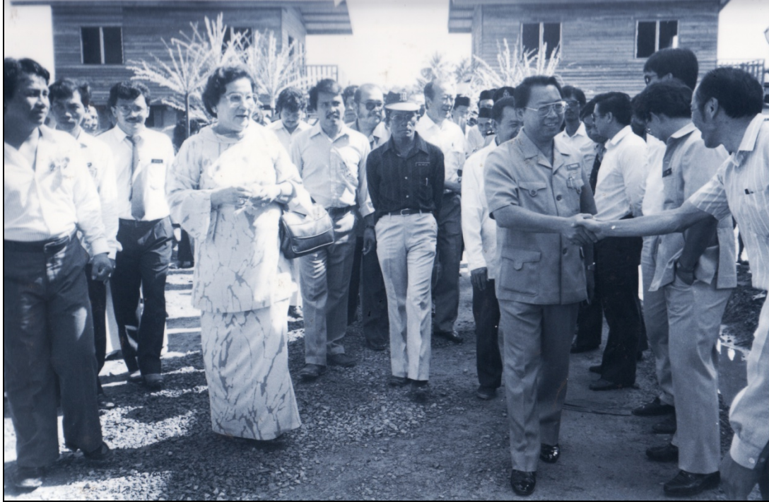
Picture 1: Joseph Pairin Kitingan during the early days of PBS's rule. Pairin was seen as an emerging "Sabah champion" and was hugely popular among the rural people who regarded him as a "folk hero". On Pairin's right is Tengku Aariah Ahmad, Sabah Minister of Social Services (photograph courtesy of Parti Bersatu Sabah (PBS)).