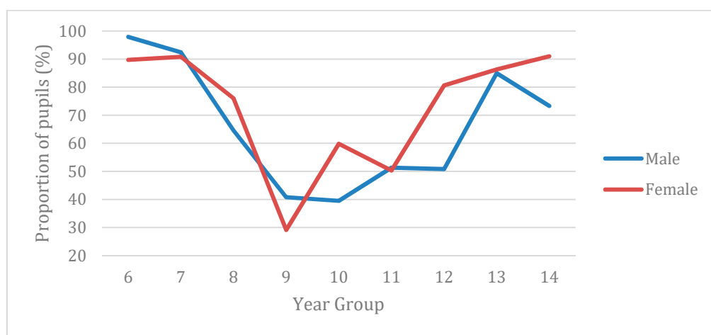
Figure 2. Proportion of males and females not achieving the recommended amount of physical education per year group.

At post-primary school level, 40.2% of participants achieved the PE guidelines; however, the proportion varied across year groups and gender (Figure 2). Males were also more likely than females to achieve the recommended 120 min per week of PE (45% vs. 34.3%), \chi^2(1, n = 1417) = 16.59, p < 0.001 , \phi = -0.110 . Schools with lower %FSM were significantly more likely to meet PE recommendations than those with higher %FSM (40.2% vs. 20.8%, p < 0.001 ).