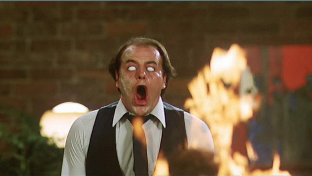
Scanners (dir, David Cronenberg, 1981)