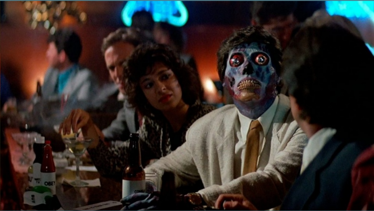
They Live (dir. John Carpenter, 1988)