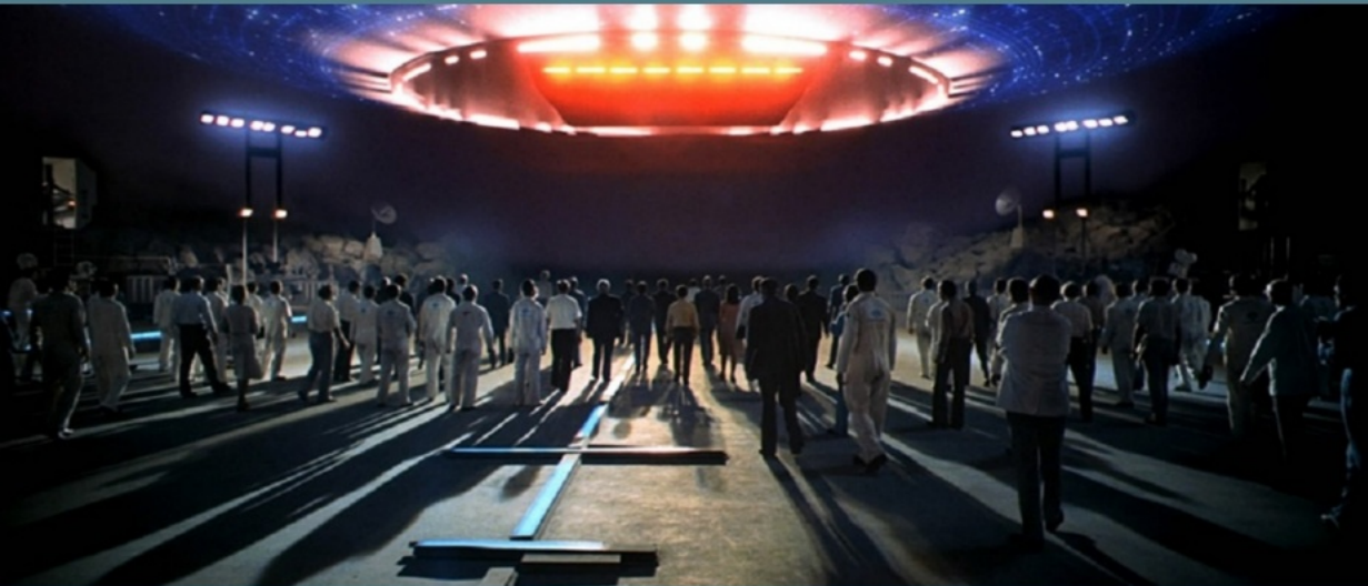
Close Encounters of the Third Kind (dir. Steven Spielberg, 1977)