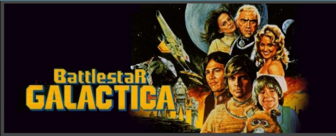
Battlestar Galactica (created by Glen A. Larson, 1978-1979)