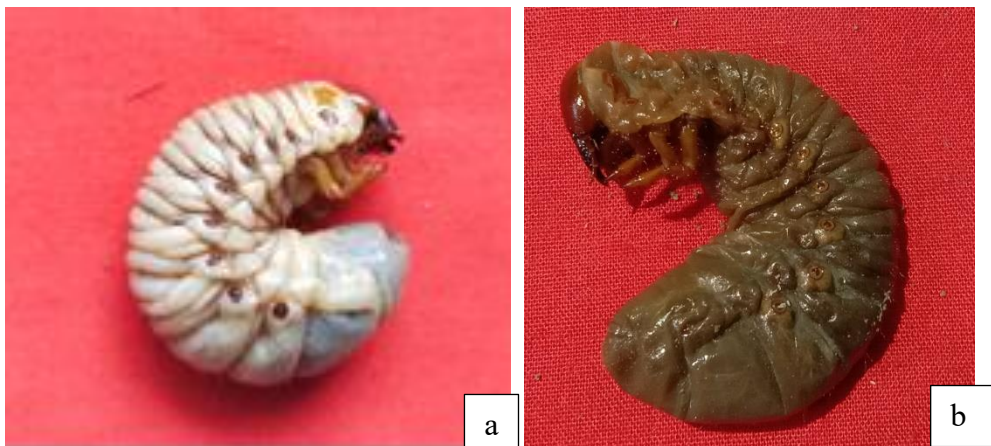
Fig. 2. Symptoms of dead larvae of Oryctes ; a. healthy larvae; b. larval cadaver.

O. rhinoceros larvae infected by B. thuringiensis bacteria showed early symptoms of decreased insect activity, color changed from white to light brown or dark brown, decreased appetite of larvae and decreased body weight. Furthermore, body color becomes dark brown and when it died, larva's body color changed to black (Figure 2). This was indicated by the presence of a fragile, watery and foul-smelling body [14].