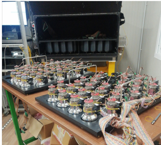
Figure 1: The dark box apparatus and two trays of R14374 PMTs ready for test

The dedicated studies on critical parameters done for the former PMT model were replicated with the new model..