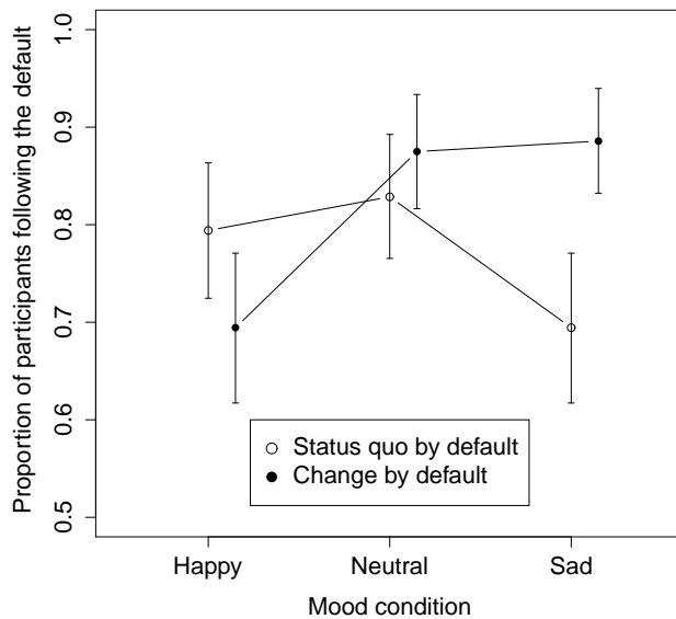
Figure 3: Proportion of participants following the default by type of default and mood condition. Error bars represent standard errors of the mean.

Participants in the happy condition were more excited than participants in the neutral condition ( p = .004 ), but did not differ from them in their ratings of anger and curiosity. There were no differences in how jittery participants felt. Mean and standard deviations of all affect measures can be found in the Appendix.