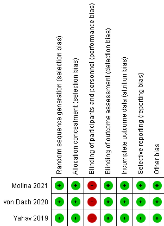
Fig. 2: Risk of bias assessment.

relapse of bacteremia, length of hospital stay, readmission, and local or distant complications, were also demonstrated to be without significant difference. No