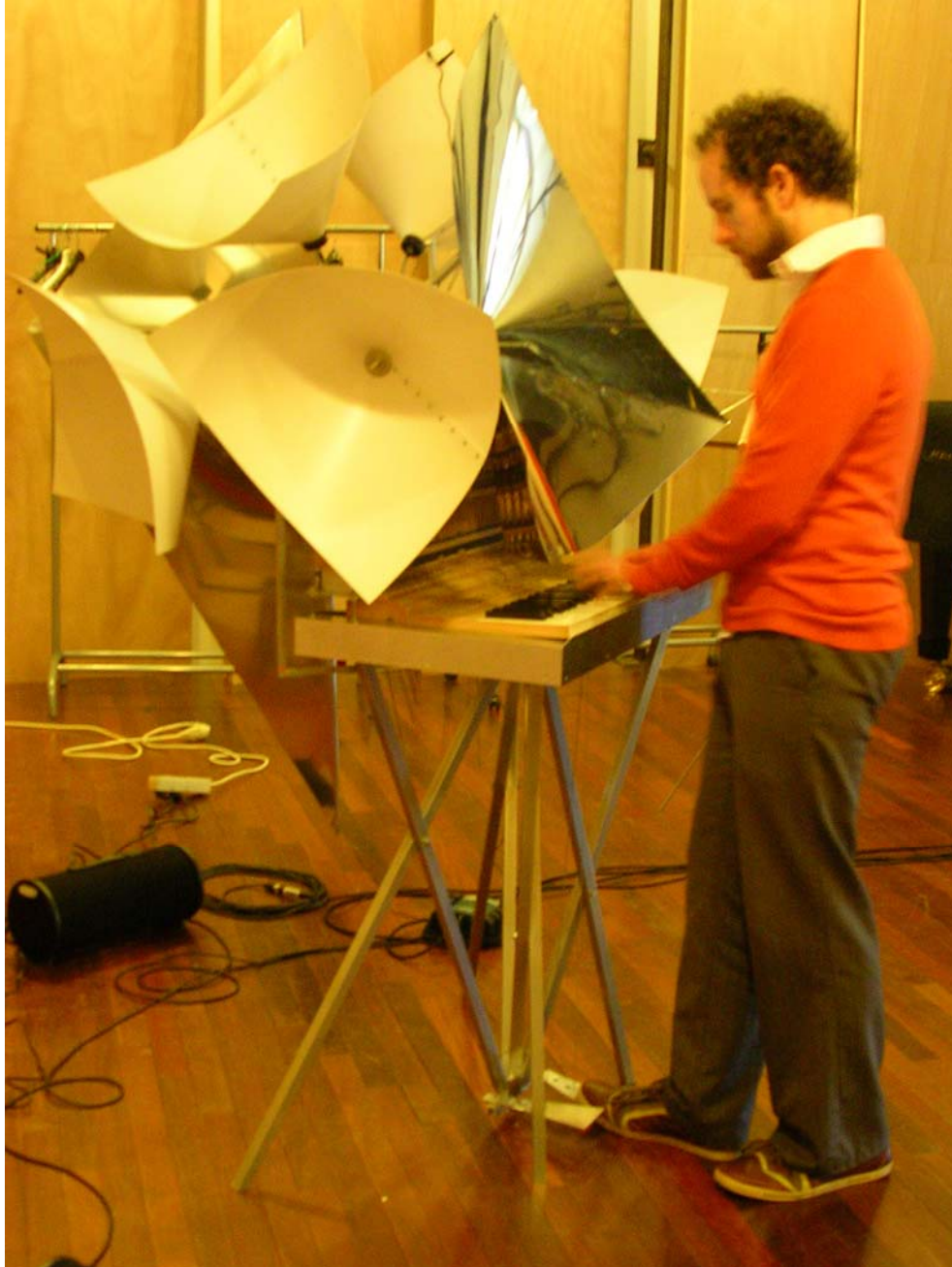
Illustration 1: Piano Baschet-Malbos

Because of the limited pitch range and dynamic spectrum, I regarded the instrument as a member of the keyboard family that includes harpsichord and