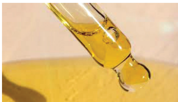
Fig. 2 – Castor oil 5 Slika 2 – Ricinusovo ulje 5

Castor oil contains a unique and rare hydroxy fatty acid, ricinolenic acid (Fig. 4), which is structurally cis-12-hydroxy-octadeca-9-ene acid (hydroxyl fatty acid with C18 atoms and one double bond). Due to castor acid, this oil