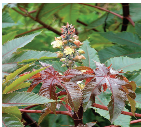
Fig. 1 – Leaves and flowers of castor oil plant ( Ricinus communis L.) 4 Slika 1 – Lišće i cvijet biljke ricinusa ( Ricinus communis L.) 4

The castor oil plant ( Ricinus communis L.) is one of the most used cultivated crops in industry, particularly as a valuable and renewable source in the chemical industry (Fig. 1). 1,2 Castor oil is obtained from the seeds of the castor oil plant by cold or hot pressing, and it is insoluble and resistant to water (Fig. 2). 3