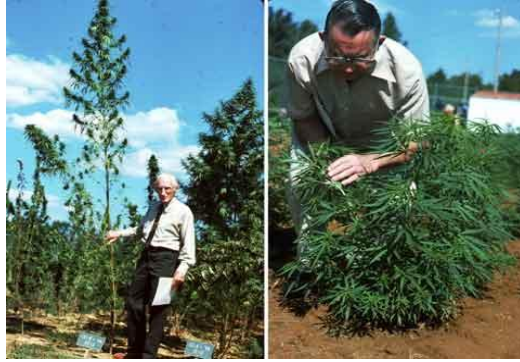
Figure 7: Differences between tall fibre plants (left) and a marihuana plant (in this case “Panama Gold”) (right)