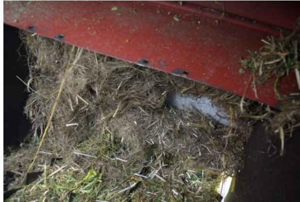
Figure 2: Freshly cut hemp stalks