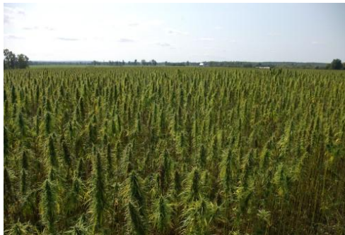
Figure 5: Industrial hemp field, seen from the harvesting machine