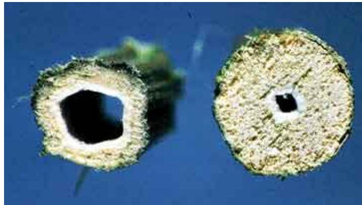
Figure 6: Cross-section of stems of the fibre-plant (left) and marihuana plant (right).