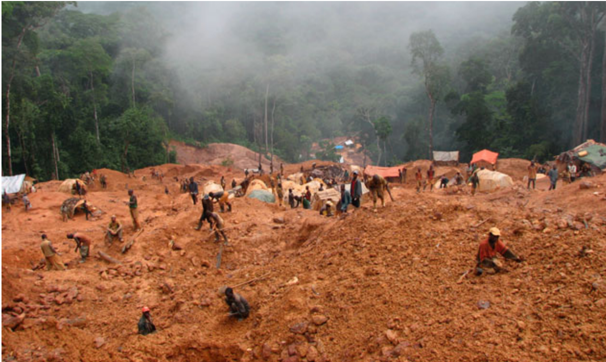
Artisanal cassiterite mining in Bisie, Walikale area, in North Kivu.