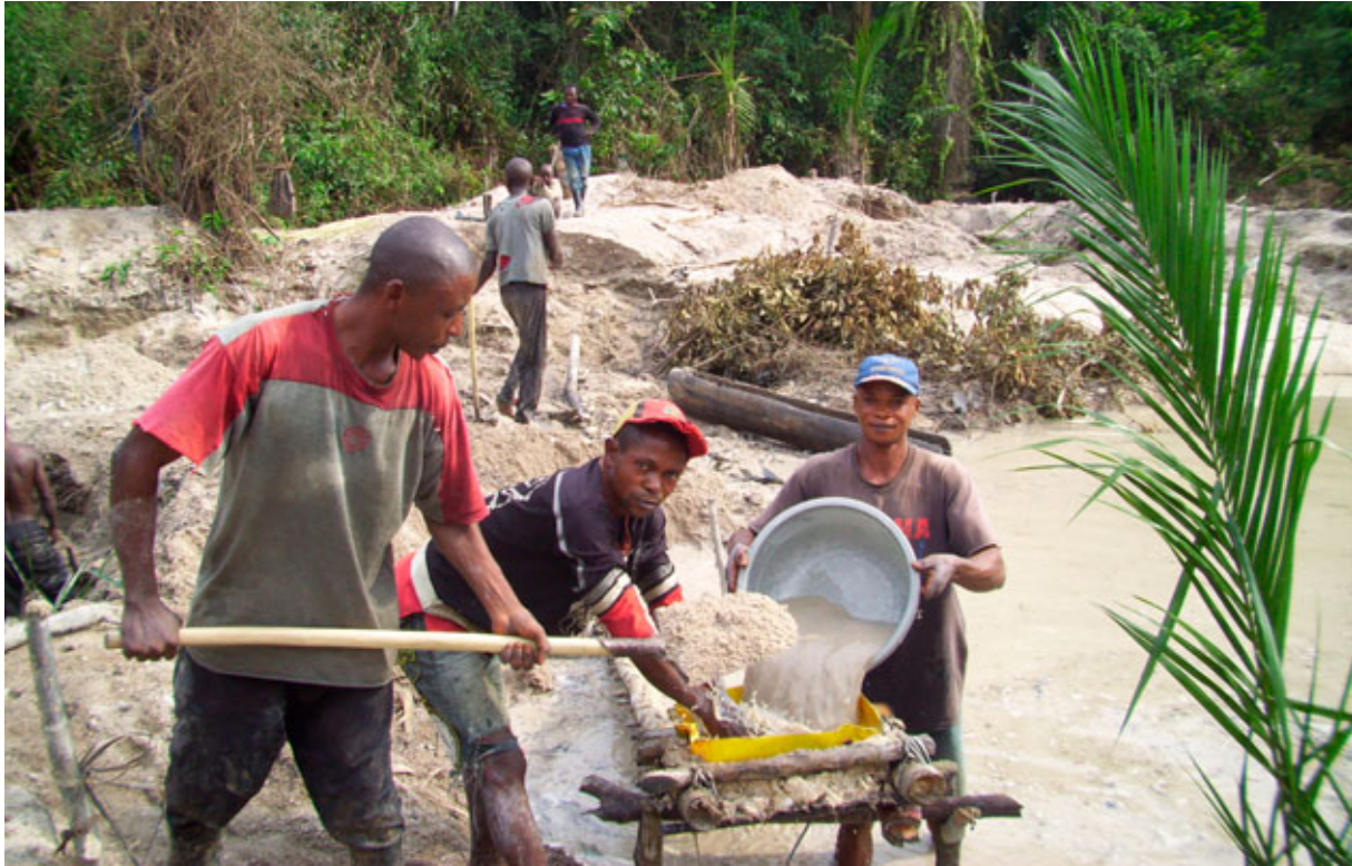
Cassiterite mining in Maniema province.