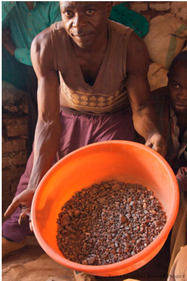
Local tin ore (cassiterite) trader.

in Eastern DRC where there are no security problems at all. 99 In other words, if there are very strict requirements regarding taxes to armed groups and no involvement of armed groups in the mineral trade at all, at the moment, it means it is not possible to source minerals from Eastern DRC at all. This is an option that Karen Hayes foresees could lead to more insecurity in the region: “Potential exclusion of mines from the traceability system with resulting loss of their legitimate market could have major impacts. This could leave mines with the options of (a) closure – resulting in loss of livelihoods, migration forced by economic need, new resource conflicts as miners try to find new sites, new debt as new sites are developed, etc; (b) continued mining and trading but with only illegal actors or buyers who are unscrupulous about their sourcing; (c) a move away from the restrictive tin/tantalum/wolframite market towards the more lucrative and secretive gold mines and markets where traceability is a huge challenge.” 100