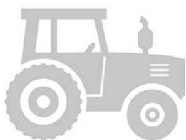
SPOUSES IN LUBERIZI TRIED DEVELOPING AGRICULTURAL ACTIVITIES

Despite these limitations, it would seem that associations for military spouses have the potential to contribute to better living conditions, at least where they address the structural conditions that disadvantage military spouses. This also applies to socio-economic projects. However, up to now, only a few donors have invested in such projects.