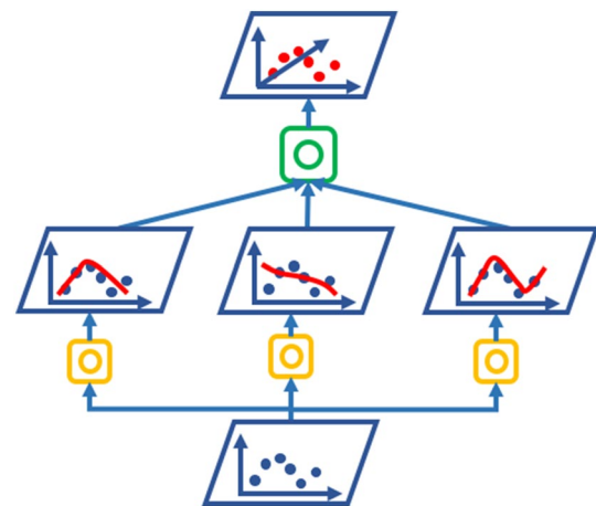
Fig. 2 Stacking DNN: data are used to train initial models (orange boxes). Their predictions are used to train the meta-learner (green box). Adapted from [11]

The research was framed as a regression task for supervised learning with training time and number of attempts labeled as target variables. The scores of each attempt on the VR simulator represented the features. Scatter plots confirmed non-linearity between features and target variables. Boxplots revealed the presence of outliers which were included to maintain a large range of proficiency-gain curves. Ensemble AI models were then applied to the dataset. These represent a family of aggregated predictors capable of providing higher accuracy than the individual predictors [11]. Examples of ensemble AI models are random forests, and gradient boosted regression trees (GBRT). In this study, DNN ensemble models were designed. In the stacking configuration of ensemble models, individual models are trained on a training set and their predictions used as input to train a meta-learner (blender), which provides the final prediction on the test data set. The process is depicted in in Fig. 2. More