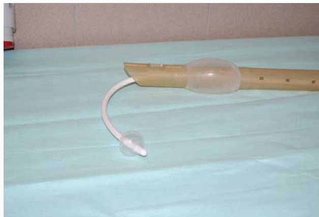
Figure 2. Distal end of the homemade tracheal tube. The broncho-alveolar catheter can be inflated until a diameter of 30-35 mm if one lung ventilation would be required.

Moderate hypotension was treated with dobutamine (Dobutamine EG, NV Eurogenerics, Belgium).