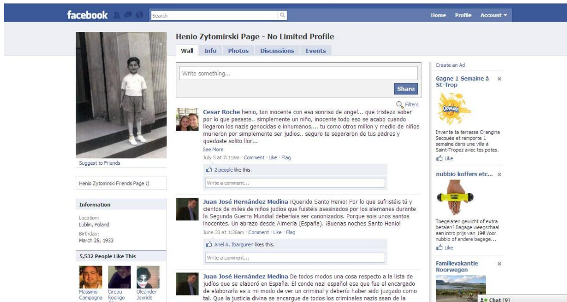
Figure 4. Screen grab of the “Henio Żytomirski Page – No Limited Profile” Wall.