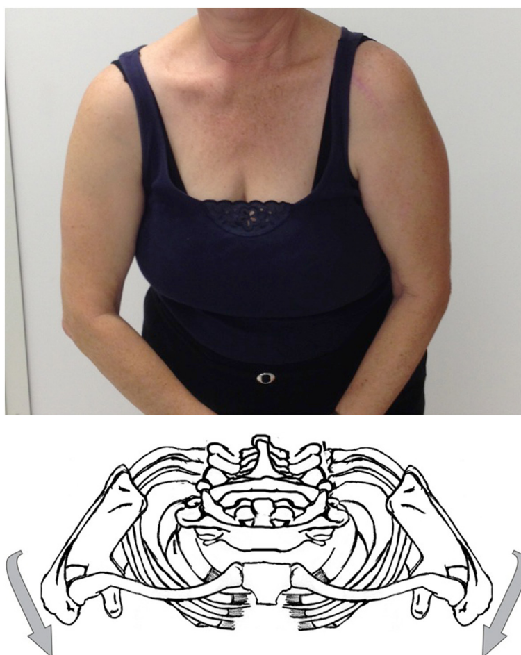
Figure 1 Active scapular protraction.

All patients were positioned in the CT gantry according to a previously described method, that is in dorsal recumbency, with a cushion on the belly and a strap around the body and this cushion, to keep the arm adducted in the coronal plane and the forearm flexed in the sagittal plane of the body [15]. This standardized position mimics a reproducible surgical position and minimizes positional errors. All sternoclavicular joints were examined with CT scans with following settings: Somatom Volume Zoom – Siemens (Siemens Business Park, Marie Curiesquare 30 - Square Marie Curie 30; 1070 Brussel – Bruxelles) ; matrix: 512/ kV:140/ eff. mAs: 350. The scan field of view (SFOV) was always 500. Radiographic parameters of rheumatoid or osteoarthritis (bone cyst, osteophytes, narrowing of the