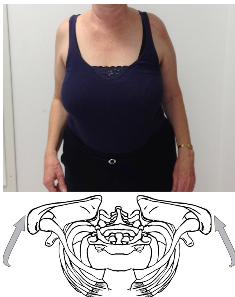
Figure 2 Active scapular retraction.

joint space, anterior subluxation), hyperostosis of the sternum, clavicles, and upper ribs (sternocostoclavicular hyperostosis (SCCH)), obliteration of the marrow space (condensing osteitis), irregularity of SCJ with bony destruction of medial end of clavicle (friederich disease) or joint effusion, bone and cartilage erosions, gas within the joint, and soft tissue swelling (septic arthritis) or no abnormality were checked on the CT.