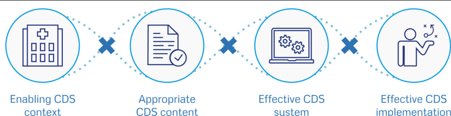
Fig. 1 Diagram presenting the four domains that are important for successful implementation of guideline-based CDS. This diagram is adapted from the formula by Fixsen on successful uses of evidence-based programs in human service settings [100]

The expert feedback on v1.2 was positive overall. Eighty-nine percent of the experts judged the checklist to be an appropriate tool for helping to identify factors that should be considered when implementing guideline-based CDS. The remaining 11% of experts were not able to judge this or commented on the limitation that the checklist does not suggest potential solutions for the problems identified or the limitation that the checklist does not address the implementability of guidelines. The experts agreed that the checklist would be applicable across different settings and different types of practices (82%). The remaining experts were uncertain as to how the checklist