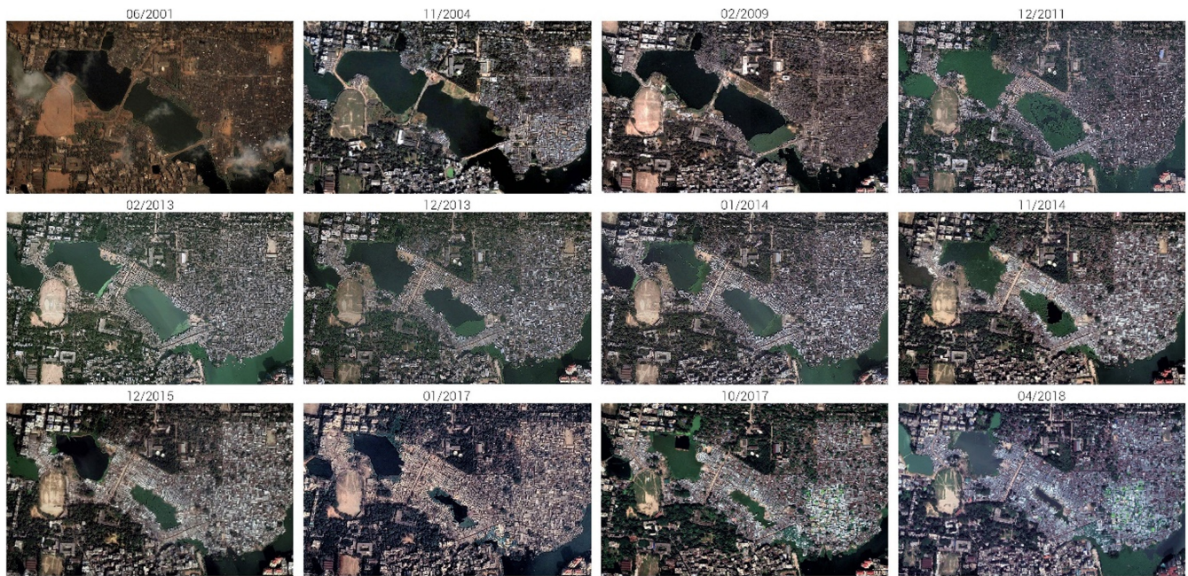
FIGURE 3 Karail 2001–2018: Conveyance of Materialities, Technicities, and Desire.

is conveyed plurally and in each repetition of it a difference is added. In that sense, conveyances of trans-configurations act as the conduit for processes of transmission to happen. In the case of Karail, precipitous incrementality is no longer only about the material deposition of debris but also encompasses the incremental social approval of local leaders, the step-by-step extraction of bribes by the police to produce a pseudo-legality, the gradual constriction of the water flow, and the progressive upsurge of ecological destruction.