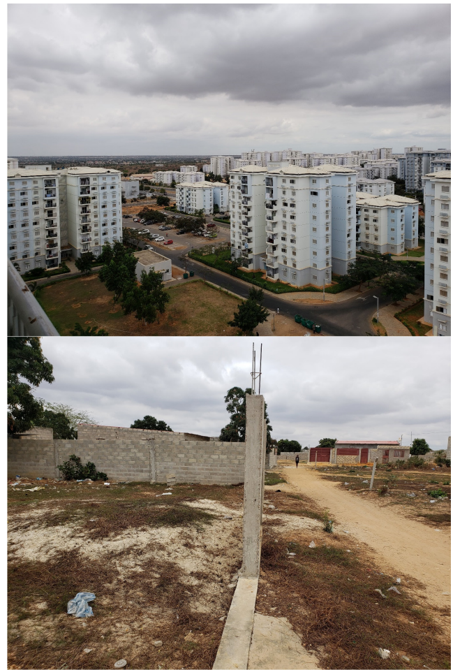
FIGURE 4 Kilamba/Progresso 2019: Transmissions of Accompaniment.

block walls, which themselves were raised from the middle, as extensions (see below) of authorised planning endeavours forged in between the blind spots of officialdom as well as of Chinese entrepreneurial efforts in the cement industry and its derivatives, the houses most of Progresso's inhabitants reside in are constantly shuffling and forever on the move. Because of their cement block walls, as well as the variable institutional and regulatory arrangements encasing their legal existence – particular conveyances (see above) of this residential (trans)configuration – they are also always about to linger just a little bit longer (Figure 4).