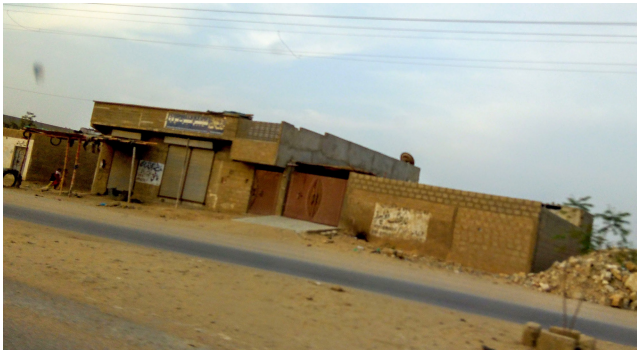
FIGURE 1 A permanently impermanent dwelling in Karachi's periphery. Most materials used can be quickly disassembled and salvaged, such as T-girders, I-beams, concrete blocks, cement vent grilles, and bamboo poles.