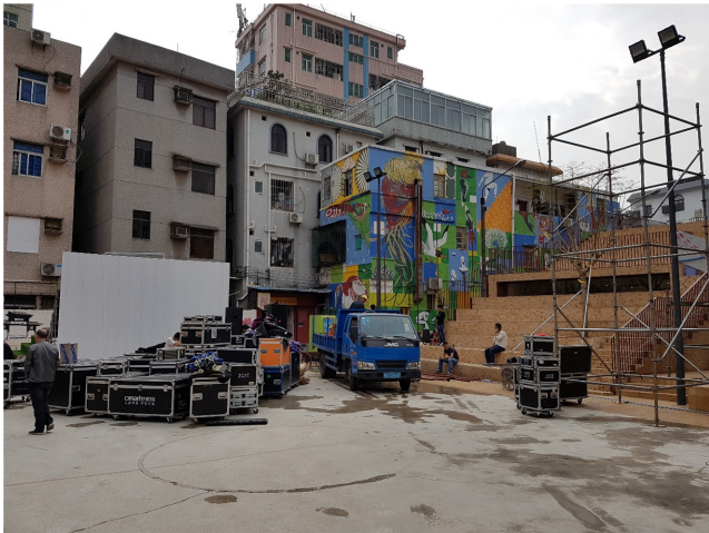
FIGURE 2 Nantou Village in Shenzhen undergoing renovation.

residents, but the physical, emotional, and financial labour involved in re-arranging and holding together this promise of permanence can be overwhelming.