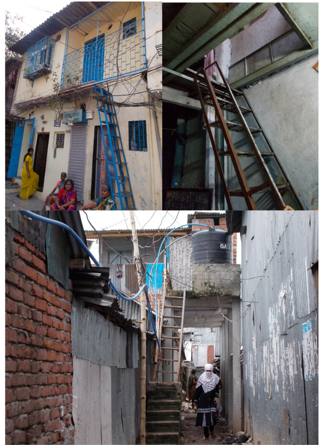
FIGURE 5 Sion-Dharavi, Mirpur (Dhaka), and Vikhroli, 2016: Extensions of Speculation.

outrage and resistance. This piece on (re)enactments will focus on how urban residents' narratives and social ways of being-in-the-world form ways to re-enact and re-envision cities from within, both conceptually and physically.