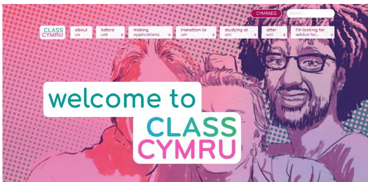
Figure 2: The CLASS Cymru homepage

In October 2022, the CLASS Cymru website 3 went live, and was launched with an event at Cardiff University's Centre for Student Life. With attendees encompassing practitioners, care-experienced students and young people, academics and charity staff, the event gave an overview of CLASS Cymru and the wider research it was based on, as well as giving opportunity for attendees to network and make new connections.