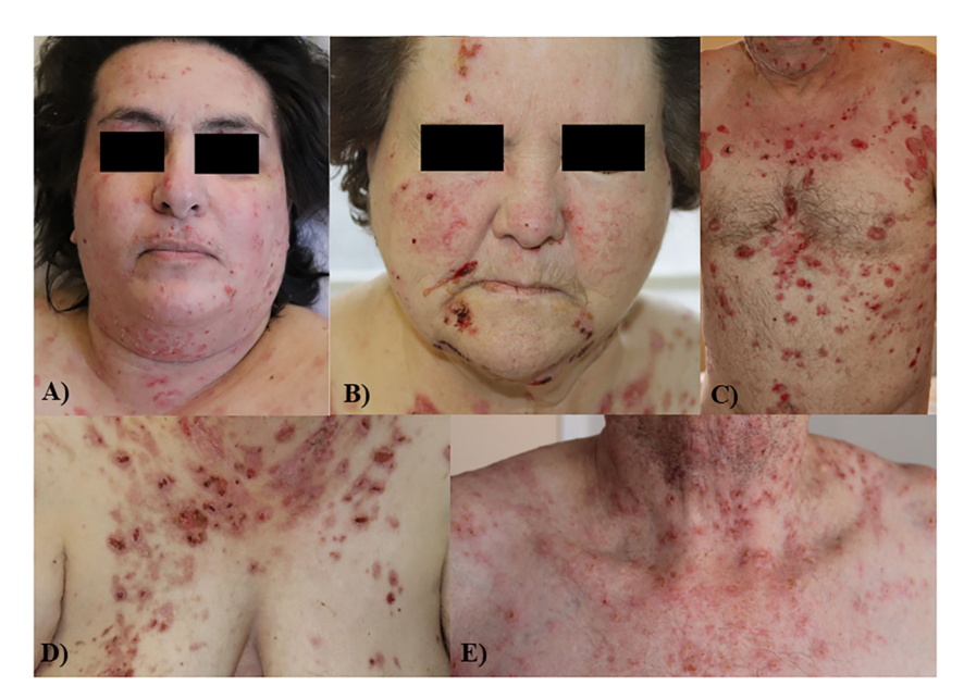
FIGURE 2 Patients with unsual severe involvement of the face (A, B), upper part of the trunk (C) and neck (D, E).

patients with BP, and iii) the predominance of skin lesion on the head, neck and upper trunk in 66.6% of patients, which is reminiscent of MMP rather than BP. Moreover, only 3 out of the 15 patients had associated debilitating neurological disorders, as it has been classically reported in BP patients (26). Finally the serological profile of these patients, which was characterised by exclusive anti-BP180 antibodies with no anti-BP230 antibodies, differed from that of classical BP sera since only 26% of BP sera