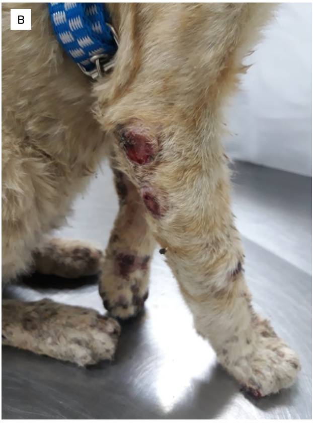
Figure 3. Cats were positive for sporotrichosis in Campos dos Goytacazes/RJ. (A) Neutered animal that could roam freely in a contaminated environment, presenting a single lesion in the right thoracic limb; (B) Non-neutered cat that could roam freely in the peridomestic area, and had disseminated lesions throughout the body.