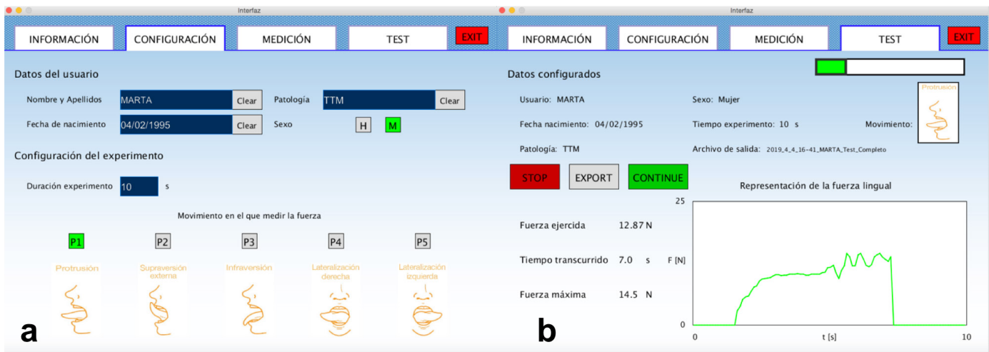
Fig. 1. Spanish prototype device interface view. a: Configuration screen view; b: Measurement screen view.

During measurements on subjects, a single-use hypoallergenic