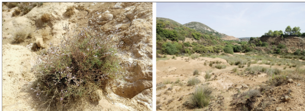
Fig.1. Blooming specimen of Limonium merxmulleri subsp. merxmulleri and an example of mine environments.