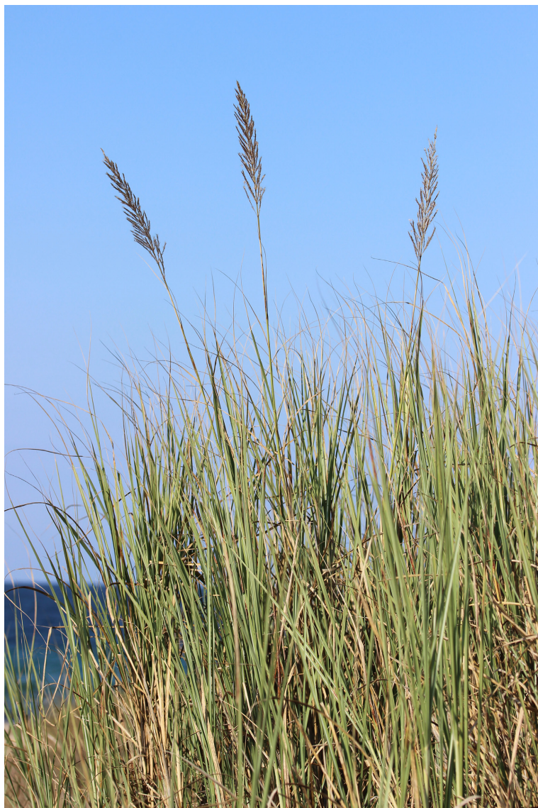
Fig. 3. Saccharum spontaneum – Greece: North Aegean, Limnos (Lemnos) island, Kotsinas, plant c. 2.2 m tall, 9 Oct 2016, photograph by J. Krause.

tanical Garden, E. virescens is a casual alien occurring in the same site as the previously discovered Oxalis latifolia Kunth (Ryff 2021). In 2021, its population occupied about 100 m 2 and included about 1000 individuals. Eragrostis virescens dominates with high abundance in Chenopodieta weed plant communities together with Amaranthus retroflexus L., Capsella bursa-pastoris (L.) Medik., Chenopodium album L. s.l., Digitaria sanguinalis (L.) Scop., Oxalis latifolia , and species of Setaria P. Beauv.