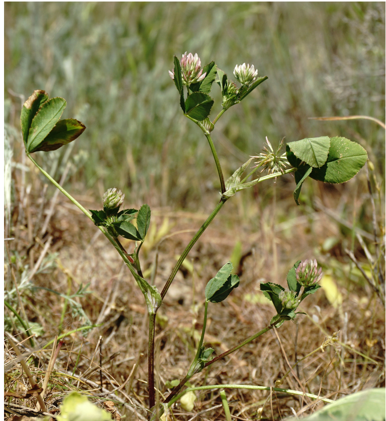
Fig. 4. Trifolium angulatum – Stem with inflorescences. – Crimea: Lenino district, Karalarty nature park, Sernaya river, 14 May 2021, photograph by S. A. Svirin.

A Gg(G): Georgia: Kakheti Region, Signaghi, 9 April Street in historical centre of town, 41°37'03"N, 45°55'27"E, c. 760 m, five plants, 21 Sep 2021, Novák (photo [Fig. S2, see Supplemental content online]). – Mirabilis jalapa is an ornamental plant of American origin that is commonly cultivated in gardens in Georgia. In