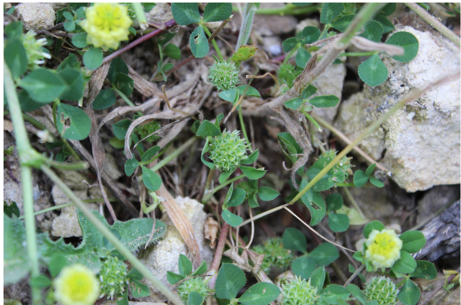
Fig. 5. Trifolium pachycalyx – Stem with inflorescences (green calyces and small, pinkish corollas); mixed with T. campestre Schreb. (conspicuous, yellow corollas). – Greece: North Aegean, Limnos (Lemnos) island, 1.5 km NW of Roussopouli, semi-wet wayside between fields, 26 Apr 2018, photograph by J. Krause.

the town of Signaghi, it was recorded as an occasionally escaping species. It was observed in the trampled vegetation (class Digitario sanguinalis-Eragrostietea minoris ), where it preferred less disturbed places, ac-