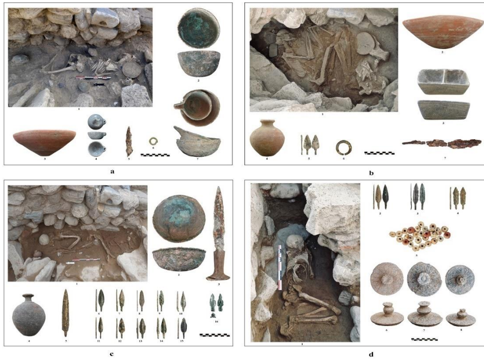
Fig. 3 - Chamber I: a. Burial 68; b. Burial 38; c. Burial 75; d. Burial 36.