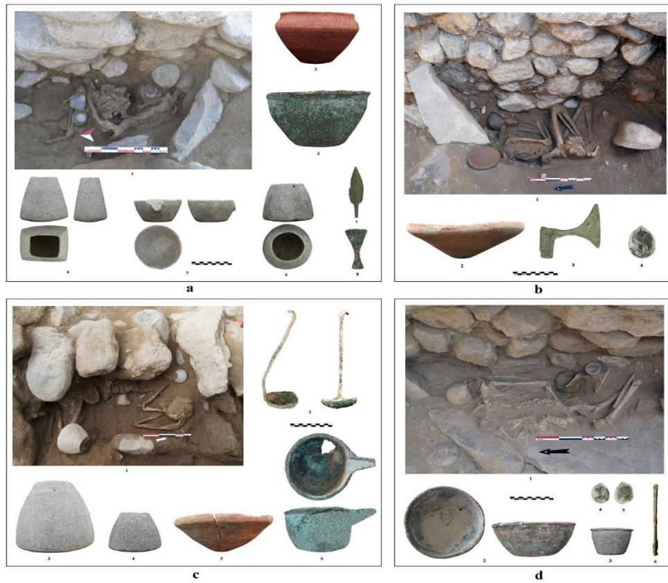
Fig. 4 - Chamber M: a. Burial 48; d. Burial 66; b. Burial 73; Chamber N: c. Burial 70.