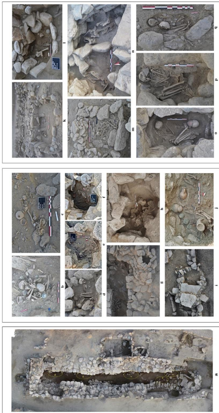
Fig. 1 - a. The LCG-2 tomb and the location of chambers; b-c. Examples of human bone clusters; d-j. Late multiple burial chambers, k-q. Burials arranged inside and outside the corridor.