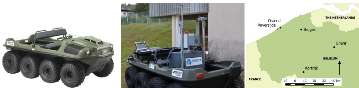
Figure 1 ARGO vehicle without (left) and with devices (middle), Location of Raversijde (right)

MTLS has already been applied for river bed mapping [Vaaja et al., 2011] and also on beaches for coastal protection applications [Bitenc et al., 2011]. For intertidal beach modelling, the driving platform needs to perform in very shallow water, but also in shifting sand. Therefore, an ARGO, an amphibious vehicle, was used (Figure 1, left & middle). Although 2D profile scanners can be used for MTLS, it is also possible to deploy regular Static Terrestrial Laser Scanning (STLS) systems configured as a profiler. Nevertheless, the centimetre accuracy of both systems is comparable. MTLS has the advantage of generating point clouds of the surface in a strip-wise manner as with airborne scanning. Using the ARGO, the scanning height will be more or less equal to the height of a scanner on a tripod. The issue concerning the large incidence angles can be reduced by limiting the scanning range and allowing enough overlap between subsequent strips [Vosselman & Maas, 2001].