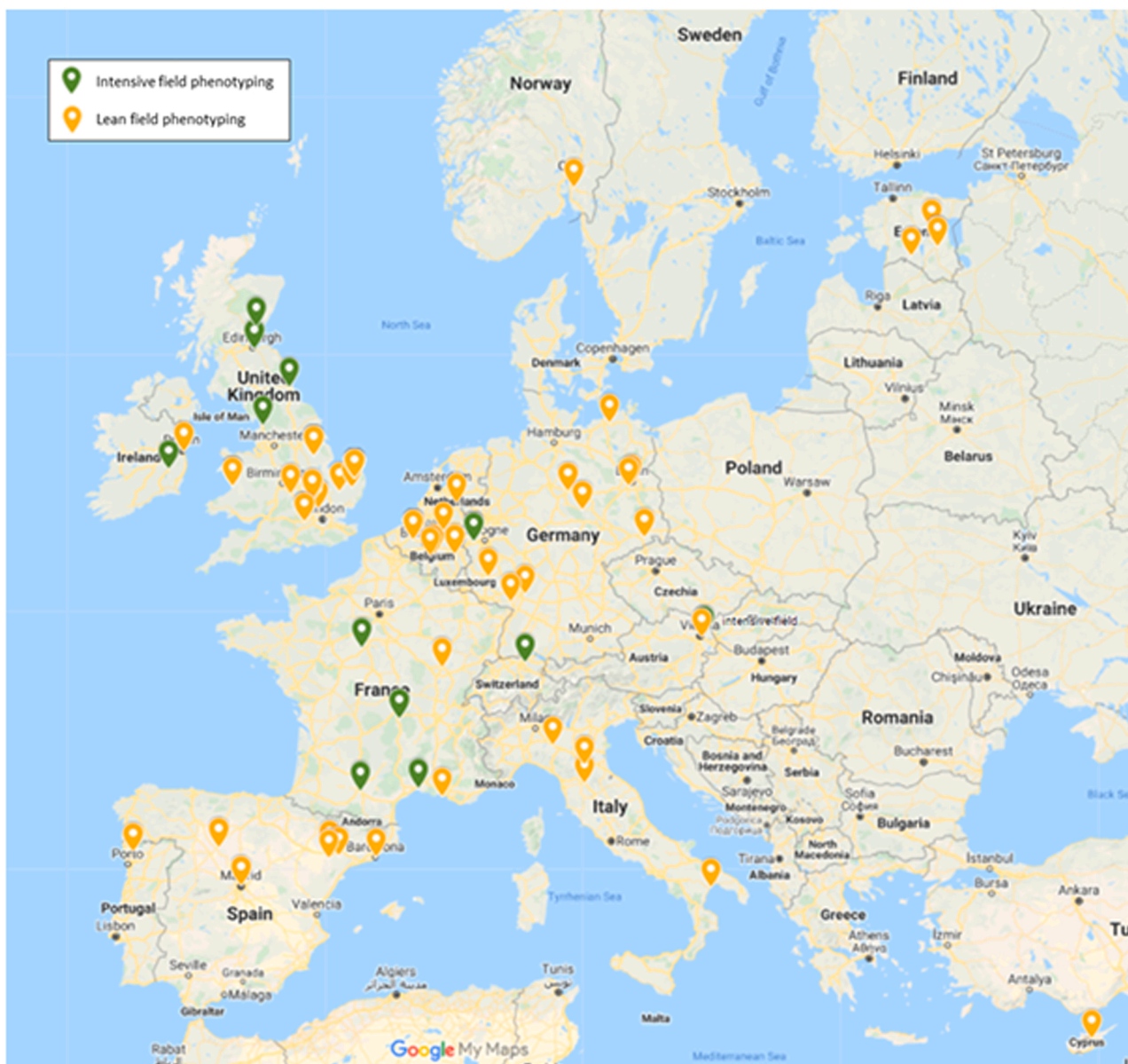
Fig. 2. Map of field phenotyping sites in Europe, mapped by the EU-funded project EMPHASIS-PREP.

quality and lower operational costs (Reynolds et al., 2019). Lean phenotyping, using affordable technologies like for example phenocarts or field phenotyping robots for proximal sensing and light-weight multispectral UAVs for remote sensing will likely be attractive for users in academia and industry with limited research budgets. Recent years have seen big advancements in the field of low-cost field phenotyping ranging from home-built phenocarts to user-friendly multispectral UAVs (e.g. DJI Phantom 4 Multispectral, https://www.dji.com/no/p4-multispectral ) for use in agriculture. Recent review papers provide an overview of available low-cost phenotyping technologies for field-based crop phenotyping (Chawade et al., 2019) and breeder-friendly phenotyping solutions (Reynolds et al., 2020). In future it may be possible to develop imputation methods to bring together data from lean and extensive fields. This offers the potential for wider coverage in field phenotyping, but likely requires significant development of data processing and analyses.