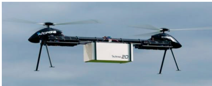
Fig. 2. Avidrone 210TL [11].

Canadian Avidrone Aerospace has introduced the CAV it developed in May 2019 Fig. 2 [11]. The CAV has a tandem rotor and the payload is carried in the frame between the rotors. The smaller version 210TL can carry 20 kilograms and the larger 490TL up to 40 kilograms payload. The range of both is up to 97 kilometers, with a cruising speed of 100 km / h. The manufacturer states that the CAV has an operating time of up to more than an hour. CAVs are made of carbon fiber to maximize the lightness of the structure. The CAV is electrically powered and has three-bladed rotors, which provide better lifting force and also reduce vibration caused by the rotors. This CAV is versatile, as it can also be used as a sensor tray, ie it can be equipped with different cameras. According to the manufacturer, the CAV is ready for use in three minutes. The manufacturer also states that it has entered into agreements with military operators. [12]