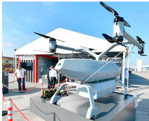
Fig. 3. Altinay Albatros [15].

Turkish UAV manufacturer Altinay presented two of its CAVs at a trade fair in Istanbul in September 2019. They are called Altinay Albatros and Altinay Sumru. The Albatros is specifically designed for CAV operations and can carry a payload of 50 to 150 kilograms, depending on the version. In appearance, the Albatros resembles a multicopter. The amount of payload can be scaled, as it is possible to connect these CAVs together, so that their individual payloads can be tripled if a maximum of three Albatrosses are combined. Which allows, for example, wounded evacuation. The company mentions various weapons and ammunition as other loads. The Albatross is powered by electric motors, which enable it to achieve a flight time of 60 minutes and a range of 30 kilometers. In Albatross, the Dual-type propeller solution Fig. 3. The flight speed is 60–100 km/h and the weight is 195–630 kilograms, depending on the version. [15]