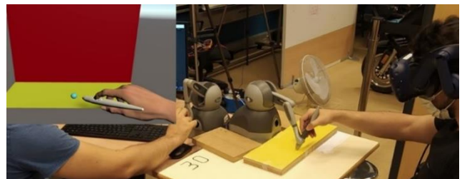
Figure 1: The VE (top left) and the experimental setup with the instructor (left) guiding the participant (right)

Objective measurements included distance estimation error (Euclidean distance between the centers of the moving sphere and the target sphere) and the pick and place completion time. Subjective measures included answers to the copresence (Qa) and the modality comparison (Qb) questionnaires.