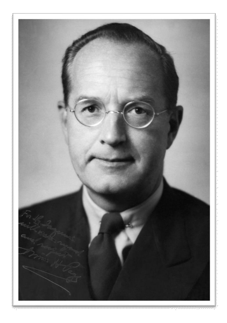
Figure 2. Original portrait of Irving Page autographed "To Dr. Taquini with warm regards and respect".

Taquini was present at that meeting, to which he had been invited to present his experience with totally ischemic kidneys (Figure 3).