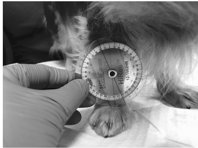
Fig. 2 A 15-cm plastic goniometer with the arms cut to the level of the dial to fit the limited space in the chondrodystrophic limb for measuring carpal valgus. The resulting total diameter of the goniometer is 7.5 cm. One arm was placed toward the lateral epicondyle of the humerus, the axis placed on the center of motion of the carpus, and the other arm parallel to the line of the third digit.

During all measurements, an assistant was holding the dog in a neutral standing position on a non-slippery surface and the person making the measurements visually confirmed equal weight-bearing to ensure that the dog was not leaning in any one direction. The owner most commonly served as the assistant. To assess intra-tester repeatability, the measurements were done twice by a veterinary surgeon with minimal training in the use of the goniometer. To assess inter-tester repeatability, the measurements were then repeated once by an animal physiotherapist with 10 years of clinical experience. Adapted from Jaegger and colleagues, 23 the measurements were collected a minimum of 10 minutes apart and the observer was blinded from the other results by recording the value on a separate recording sheet, and revision of the other sets was not allowed. Both observers performed the measurements during the same day, to ensure invariant clinical