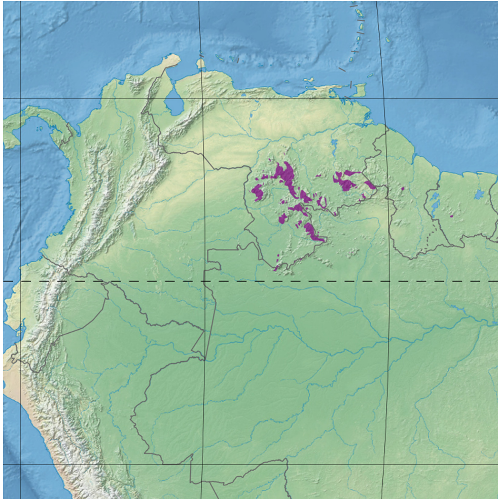
Figure 1. The Pantepui ecoregion of Venezuela.

are illustrated as median pores (sometimes named luminal pores), or they lie rather tightly adjacent to the chlorophyll cells as commissural pores in \pm continuous rows. 2) Imperfect pores are unringed and only with a membrane thinning, but without perforation. Such imperfect pores look paler when stained leaves are examined in microscope. 3) Pseudopores are without perforations, closely facing the chlorophyll cells, and are delimited by semi-circular, semi-elliptic to elongate-rectangular fibril bands connected to the inner walls, and sometimes have thin membranes. Pseudopores are usually confined to the concave leaf surface.