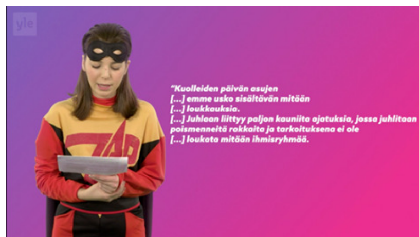
Figure 2. The suddenness of the teachable moment on diversity ( Yle Mix , 30 October 2020, 8.09 min).

The Yle Mix videos from 7 October 2020 and 30 September 2020 are two other examples of this storytelling technique. In the video on the US presidential election ( Yle Mix , 7 October 2020), the story starts with a general discussion on the importance of voting and children’s thoughts on democracy and continues with a discussion on how the two candidates’ agendas differ from each other. When a Yle correspondent reporting