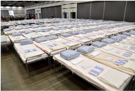
Figure A12. Helsingin Sanomat, 22.4.2020.