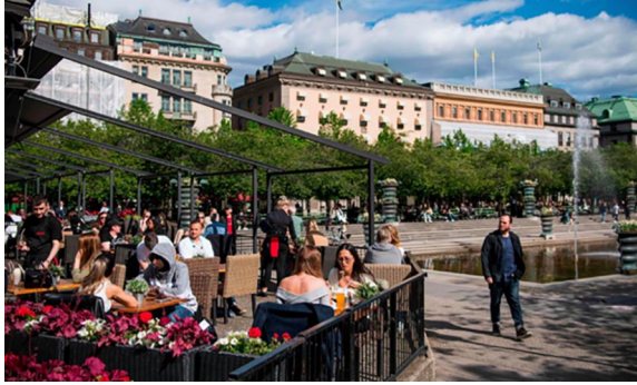
Figure A5. Helsingin Sanomat, 11.6.2020.