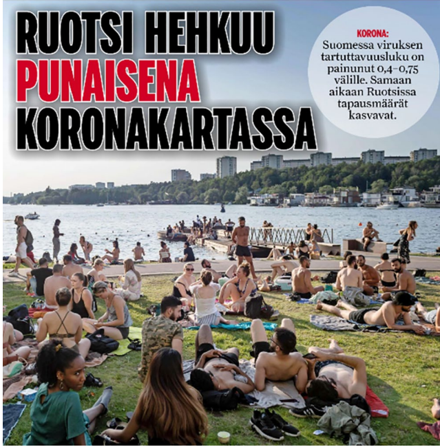
Figure A9. Ilta-Sanomat, 26.6.2020.