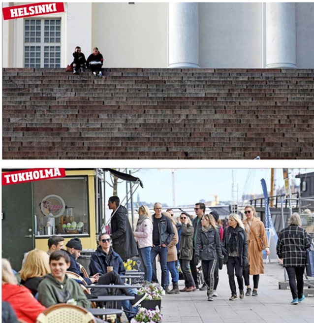
Figure A6. Ilta-Sanomat, 22.4.2020.