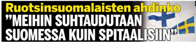
Figure A18. Ilta-Sanomat 27.8.2020.