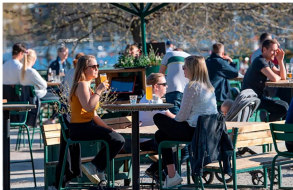
Figure A4. Helsingin Sanomat, 1.5.2020.