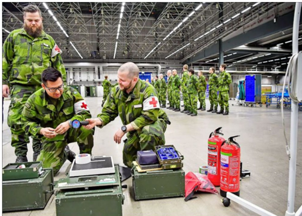
Figure A13. Ilta-Sanomat, 3.4.2020.