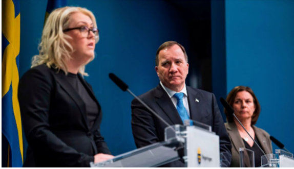
Figure A11. Helsingin Sanomat 6.4.2020.