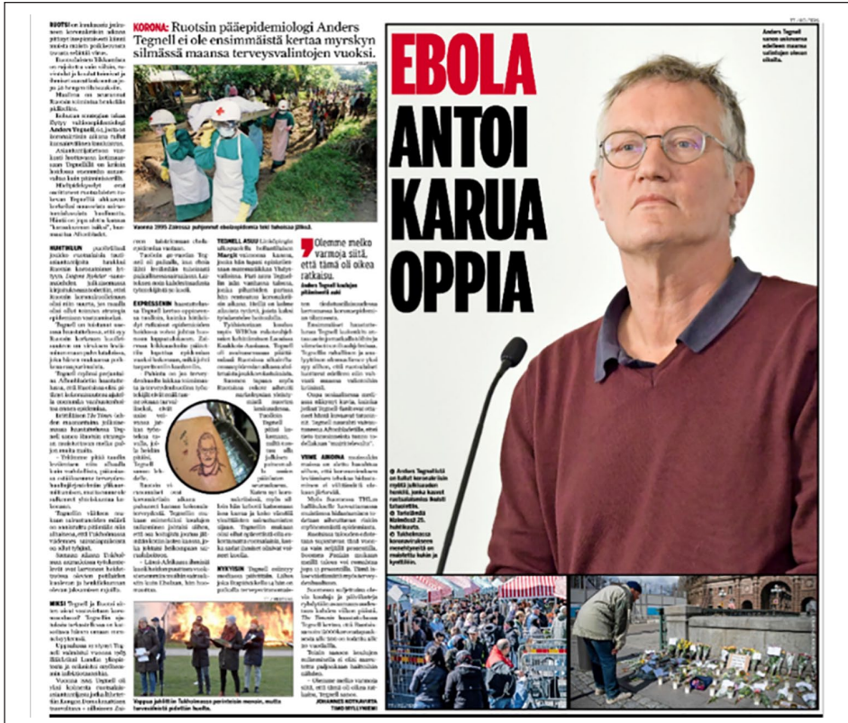
Figure A1. Ilta-Sanomat, 2.5.2020.