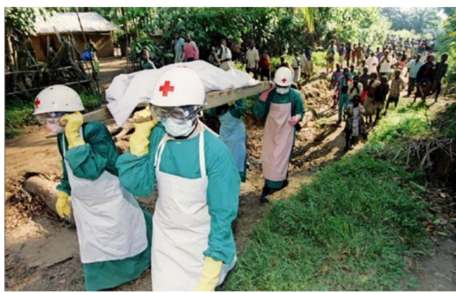
Figure A2. Ilta-Sanomat, 2.5.2020.