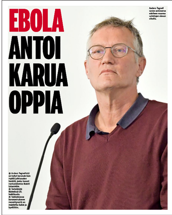
Figure A3. Ilta-Sanomat, 2.5.2020.