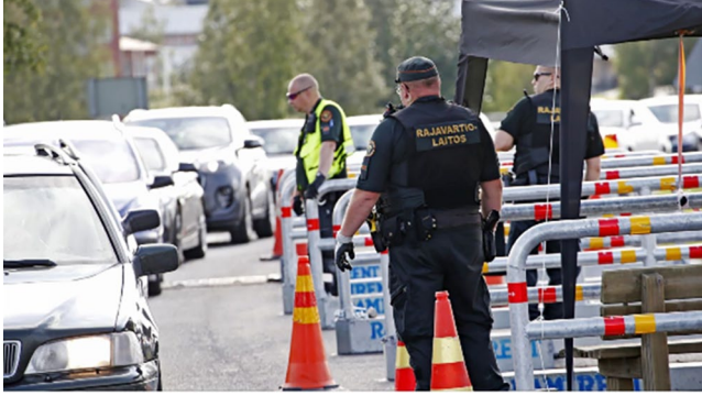
Figure A14. Ilta-Sanomat 27.8.2020.