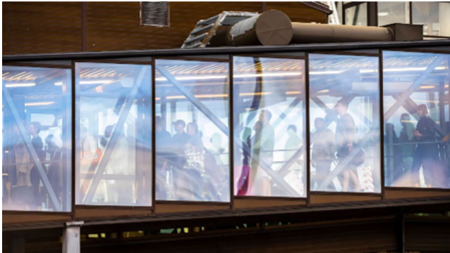
Figure A15. Helsingin Sanomat, 24.7.2020.