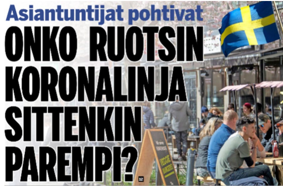
Figure A17. Ilta-Sanomat 16.4.2020.