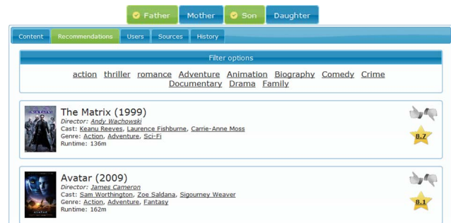
Figure 1: A screenshot of the recommender system

Groups can be created or changed easily by the users according to the current situation in the home. E.g., a group can be composed for the family members that are going to watch a movie this evening. In addition to adding or removing members of a group, users can assign a personal importance weight to each member of the group. These weights can be used to express for example that older people (such