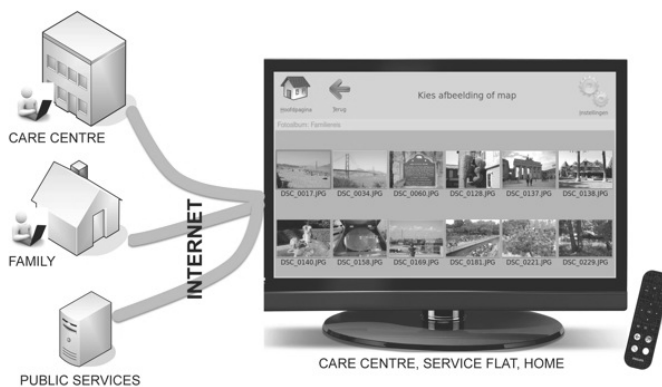
Figure 1: TV Kiosk Prototype

Figure 1 depicts schematically where the content can originate from in our prototype setup. A daughter to her mother in the care centre for example shares the pictures shown in the family group. Another group able to share pictures is the group of the care centre. Behind the scenes, these family or care centre groups are actually mapped to trusted networks, which are implemented using the Virtual Private Ad-Hoc Network (VPAN) platform [6]. This platform combines ad hoc networking, peer-to-peer techniques and ubiquitous computing aspects to realize communication between trusted groups of devices [7]. In this way unlike most other centralized solutions controlled by a single provider, we offer a peer-to-peer decentralized solution, to enable a flexible, self-organizing solution interconnecting all actors (e.g. care dependent, family, caregivers) over the Internet in a secure way. So this is a non-server based model, and pictures or other data do not have to be uploaded to a server, but all data stays on the local devices. This is different from the solutions produced in other European projects, for an overview we refer to previous work. [6]