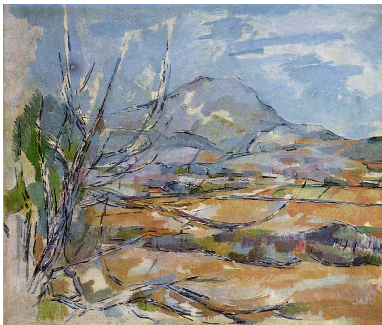
Fig. 4: Paul Cézanne, Mont Sainte-Victoire (between 1885 and 1887), Public Domain, Wikimedia, https://commons.wikimedia.org/wiki/File:Montagne_Sainte-Victoire,_par_Paul_C%C3%A9zanne_106.jpg .