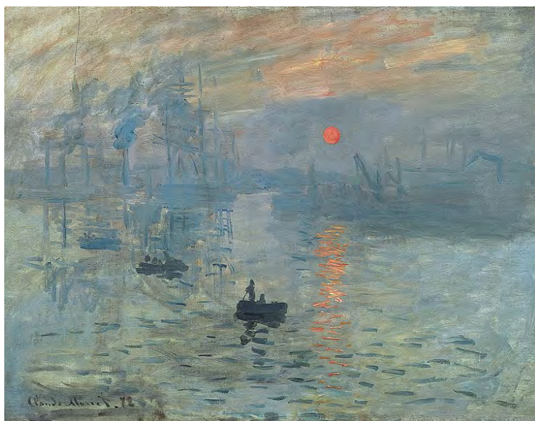
Fig. 3: Claude Monet, Impression, Sunrise (1872), Public Domain, Wikimedia, https://commons.wikimedia.org/wiki/File:Claude_Monet,_Impression,_soleil_levant.jpg .