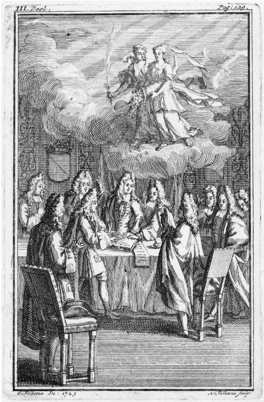
FIGURE 0.2 The Peace of Utrecht . Engraving by Anna Folkema. From: Roeland van Leuwe, Mengelwerken (Amsterdam: J. Verheyden, 1723).