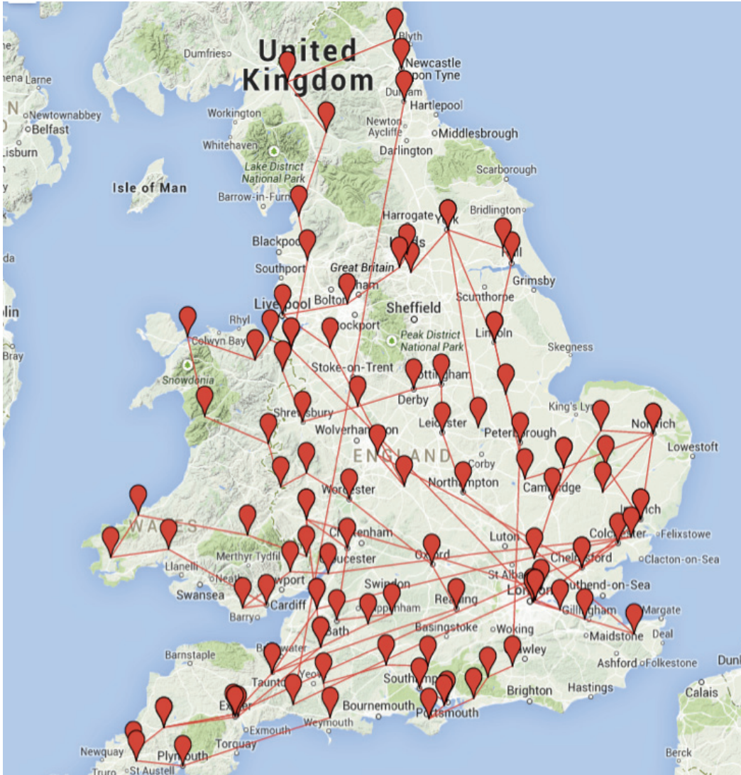
John Howard's travels in England during 1774