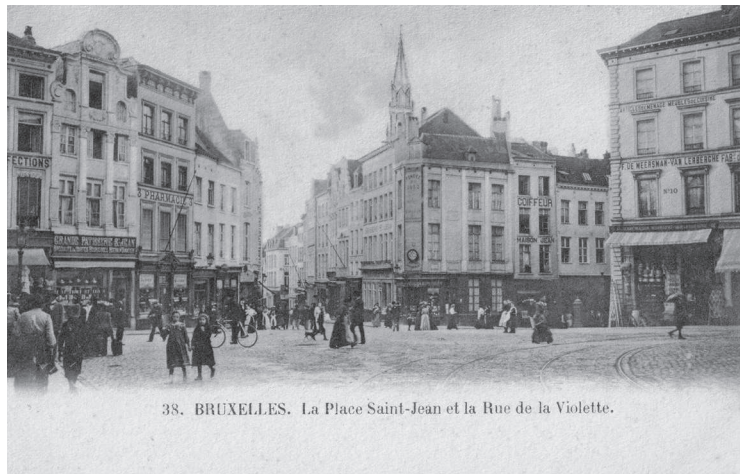
38. BRUXELLES. La Place Saint-Jean et la Rue de la Violette. 8. Coloured picture postcard of the Sint-Jansplein/place Saint-Jean in Brussels. Stamped 1904. (private collection)

Yet Petit's statue was not placed in Molenbeek, but on the Sint-Jansplein/place Saint Jean, a more prestigious location in the historical heart of Brussels, symbolising her status as a true national heroine. Although constructed in 1845, 14 the square remained empty until 1918 [fig.8], when one of the seven temporary stucco monuments previously mentioned was placed there: a group entitled To our soldiers who died for the fatherland (À nos soldats morts pour la patrie) by Louis Mascré (1871–1927) [fig.9]. The square swiftly became a place of national commemoration. The Petit statue was inaugurated five years later, on July 21, 1923, in the presence of over 500 notables, including Queen Elisabeth and her daughter, princess Marie-José. 15 After the inauguration, picture postcards prominently featuring the Petit statue replaced postcards of the pre-war square [fig.8], which involved altering the camera angle and distance [fig.4].