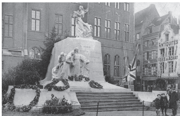
5. Picture postcard of the temporary monument for Edith Cavell (by J. Marin) erected behind the Brussels' Grote Markt/Grand Place in November 1918. Nels-Ern. Thill, Brussels (Postcard-collection Dexia Bank, Brussels)

mémoire originates from the sense that there is no spontaneous memory. Commemoration needs to be organised deliberately and be attached to 'sites', with their own material, symbolic and functional features. Moreover in the book, the monument is categorized as a so-called 'place of history'. These 'places' are considered by the editors as constitutive for establishing an enduring history of the national community to legitimise the nation state, as imagined since the 19 th century.