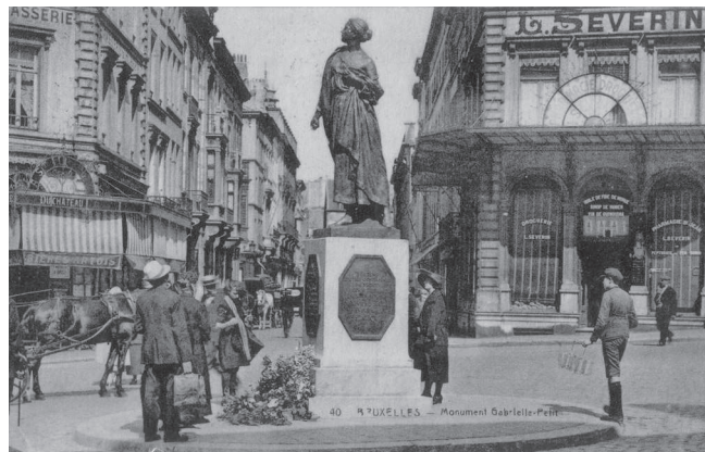
10. Picture postcard of the Petit statue on the Sint-Jansplein/place Saint-Jean in Brussels. Rare landscape format. Stamped 1924, E. Desaix, Brussels. (private collection)

Since the late 19 th century (e.g. Alinari brothers, Eugène Atget), but mainly after the Second World War, public sculpture has been represented from unseen viewpoints and in close-up, without any distance and context, almost bringing the stone or bronze to life. A late example of this evolution are the post-war, subjective and quite overwhelming pictures of Brussels statues by Julien Coulommier (°1922) in Statues de Bruxelles (Baetens, 2002; Coulommier & Broodthaers, 1957/1987) or those in Brussels: Silent Witnesses (Ranieri, Ribas & Vanden Eeckhoudt, 1979). In contrast, the picture postcards from the Belle Époque and interwar period, show the person explicitly on its pedestal, as a glorified hero(ine), superior to his or her earthly passers-by. A comparison of postcards from this period demonstrates that the statue is often shown centrally and frontally or at a three-quarter angle, with a foreground, and, more often than not, shot from a low-angle, mainly because of the height of the pedestal, creating distance, difference and context. This way of photographing the monument corresponds to a view on sculpture as a grand art and a means of glorifying grands hommes – even when women are represented. 24