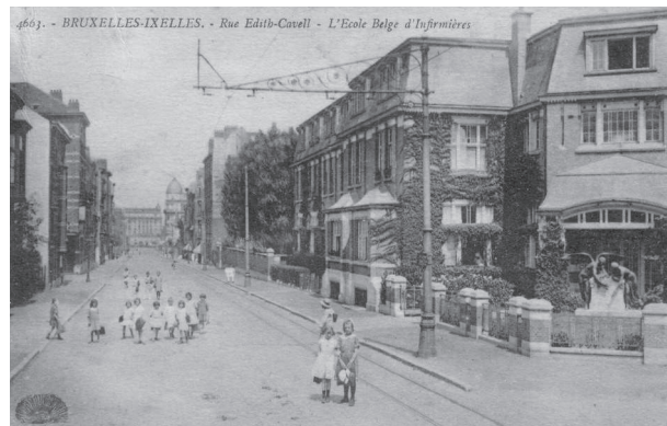
7. Picture postcard of the Edith Cavell nursing school and the Cavell-Depage monument on the corner of rue Edith Cavellstraat and rue Marie Depagestraat in Ukkel/Uccle, Brussels.