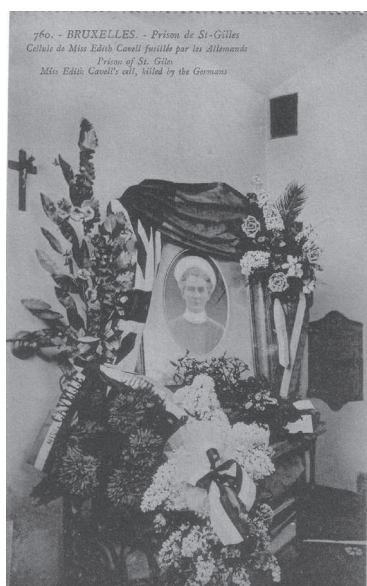
2. Numbered picture postcard of the shrine in Edith Cavell's cell in St. Gilles Prison in Brussels. Henri Georges éditeur, Brussels.

These two early places of memory ( lieux de mémoire ), and even of pilgrimage, correspond to both heroines and as such closely connect them to each other. Postcards of the facade of the National Shooting Range building (1889) are a good example. Already an attraction and subject of postcards before the war, the shooting range became a common decor for commemorating Cavell and Petit. The women feature prominently on several postcards via their photographic portraits in medallion format, while no explicit reference is made to the nature and dates of their deaths [fig.1]. The publishers clearly assumed that the connection of both women to the location, and their connection to each other, was generally known.