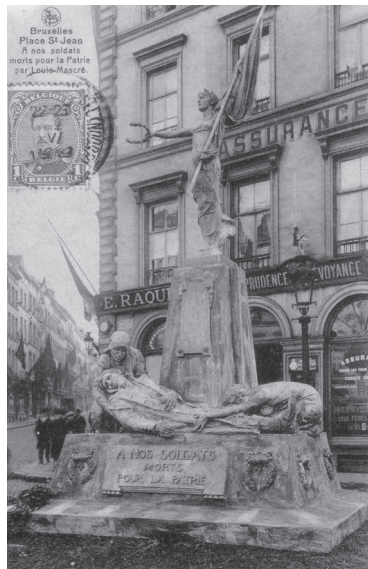
9. Picture postcard of the temporary monument 'À nos soldats morts pour la Patrie' (by L. Mascré) erected on the Sint-Jansplein/place Saint-Jean in Brussels in November 1918. Stamped 1919, Nels-Thill Bruxelles. (private collection)

wide (inter)national circulation and had a huge social and artistic impact. When looking at sent postcards, their commemorative function as well as the portability or transferability of memory comes to the forefront. Frequently, the correspondent explicitly refers to the represented monument or, even more often to the person and facts represented by the actual monument. A clear example is the handwritten addition 'Souvenir of war. Brussels 1918' on a postcard featuring Cavell's monument in Brussels. On the flip side, the sender writes 'Following your wish, I send you a small souvenir of Miss Edith Cavell.' 17 Another example can be found on a postcard sent by a woman to a male correspondent in Paris in May 1920, four years after Petit's death. It features a well-known photograph of Petit made by a Brussels photographer just before or during the war. This picture, appearing in several post-war publications, was also used in picture postcards. Under the handwritten and pre-printed captions, the sender explicitly comments on the photograph of the heroine: " When in Paris there are beautiful women, in Belgium, there are courageous women. Long live Gabrielle Petit! " 18 The sheer number of unsent postcards of these monuments still found today seems to indicate that many of them were in fact kept for diverse, among other commemorative, purposes.