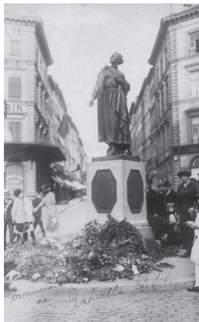
4. Photo card of the statue of Gabrielle Petit (by E. Rombaux) on the Sint-Jansplein/place Saint-Jean (Brussels). The picture was probably taken shortly after the inauguration in July 1923.

As is argued by Sophie De Schaepdrijver in her contribution to België, een parcours van herinnering (2008), the Belgian dependent of Pierre Nora's Les lieux de mémoire (1984–1992), the statue of Gabrielle Petit in Brussels can definitely be seen as a realm of memory, a place (here in the literal sense) where history lingers and can be felt. The monument as lieu de