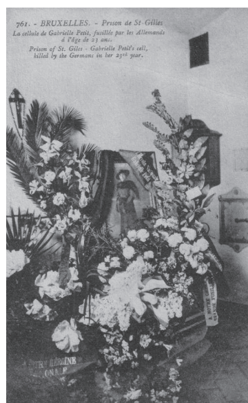
3. Numbered picture postcard of the shrine in Gabrielle Petit's cell in St. Gilles Prison in Brussels. Henri Georges éditeur, Brussels. (private collection)

Similar remarks could apply to St-Gillis/St. Gilles prison. While the exterior of the neo-Tudor building (1884) was the subject of numerous picture postcards both before and after the war, the interior became a photographic subject only after the war. The respective prison cells of Petit and Cavell were photographed according to similar representational strategies, thus shaping memories to the same mould, and closely connecting the commemoration of both women [figs.2, 3]. As well as a similar camera angle and level, the mise-en-scène of the postcards is also alike, prominently featuring a framed photograph of the respective heroine (the image within the image), a crucifix on the wall, flowers and memorial wreaths, readable mourning ribbons, etc. Only a closer look reveals small differences between