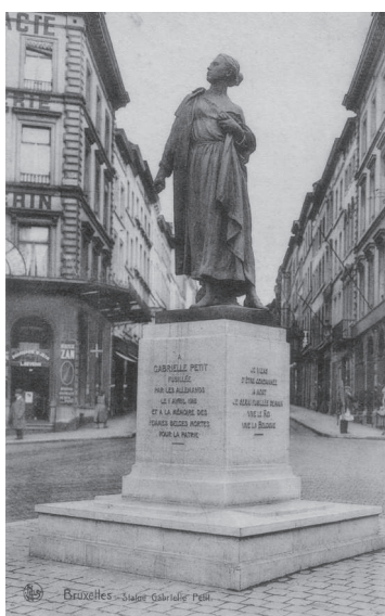
11. Picture postcard of the Petit statue on the renewed Sint-Jansplein/ place Saint-Jean with the new pedestal. Mid 1930s, Nels-Ern. Thill, Brussels. (private collection)

On closer examination, the temporary Cavell memorial, carefully cordoned off from the general public, only seems to be decorated with official wreaths and British flags [fig.5]. This may suggest that it wasn't a place intended for popular expressions of public gratitude or private grief. The posture of extras in these photographs suggests a distance between the Belgians and the British heroine as well as the British ally: when people are present, they form small groups and remain at a distance. In contrast, in photographs of the Petit monument, the pedestal is covered with numerous posies and small bouquets, and members of the public stand close to the monument [figs.4,10]. Here the iconography and mise-en-scène of the pictures denote proximity between the monument and the public. Although the statue is placed in the middle of the square and surrounded by streets, people are walking up to the monument, examining it closely, reading the inscriptions on all sides, looking up at Petit's face, while carriages and cars pass by. Although some people are looking at the camera, they are not posing but merely curious about the photographer's presence. Petit was considered a national heroine, uniting Flemish and Walloons as well as all social classes, and this seems to be reflected in the picture postcards.