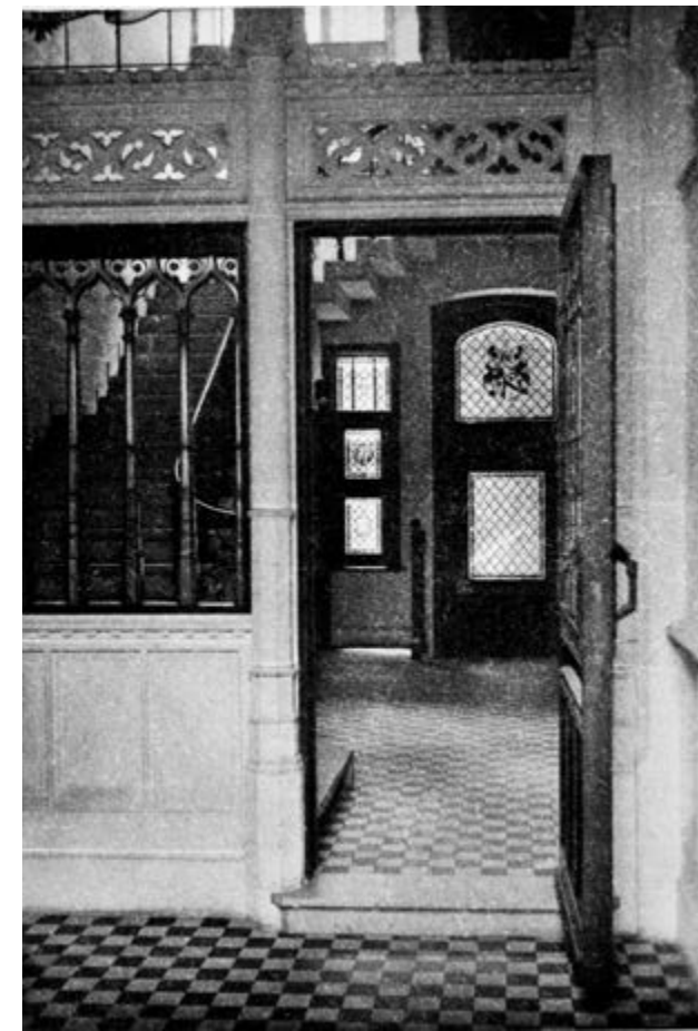
FIG. 6 Museum Mayer van den Bergh, Antwerp, Vestibule , First half of the twentieth century, Photograph: anonymous, Universiteitsbibliotheek Ghent, BRKZ. TOPO.1062.E.04