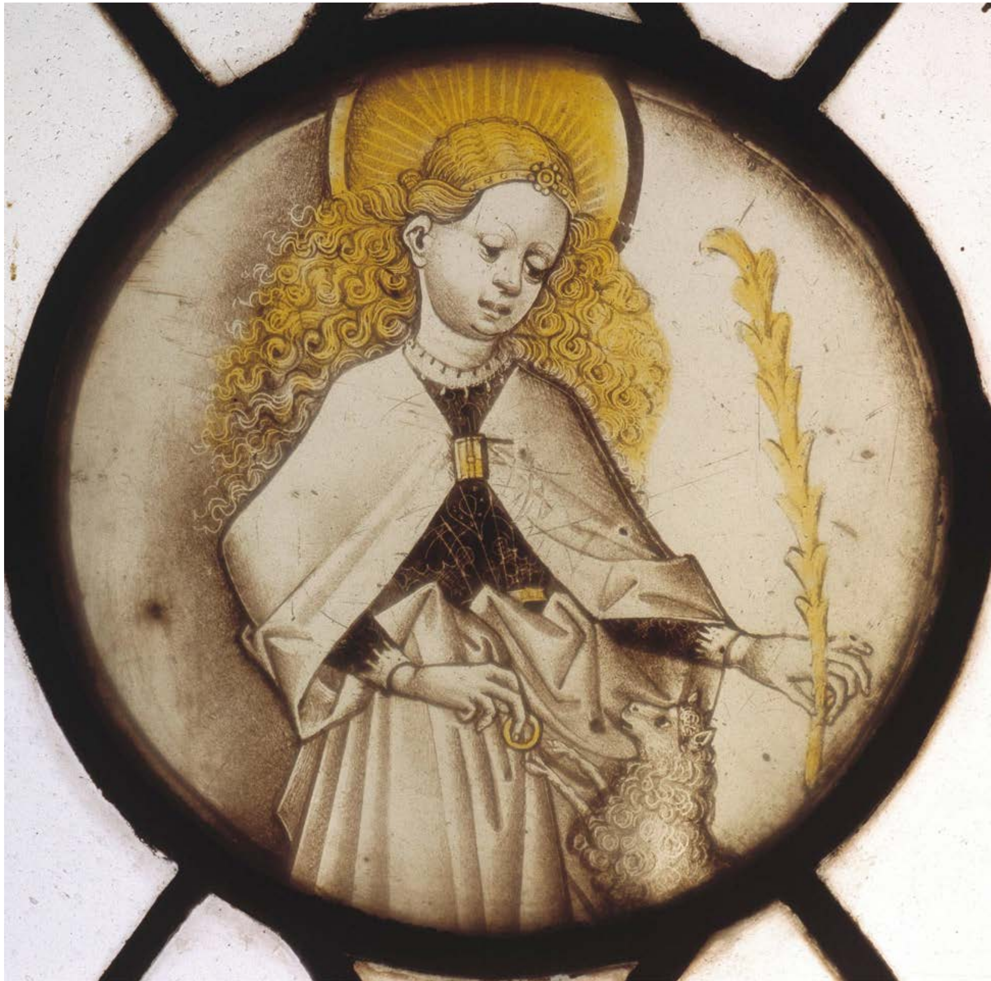
FIG. 7 Saint Agnes of Rome , Low Countries or Germany (?), Mid-15 th century, Ø 18,6 cm, inv. no. 632, Photograph: Beeldarchief Collectie Antwerpen, © Museum Mayer van den Bergh, Antwerp