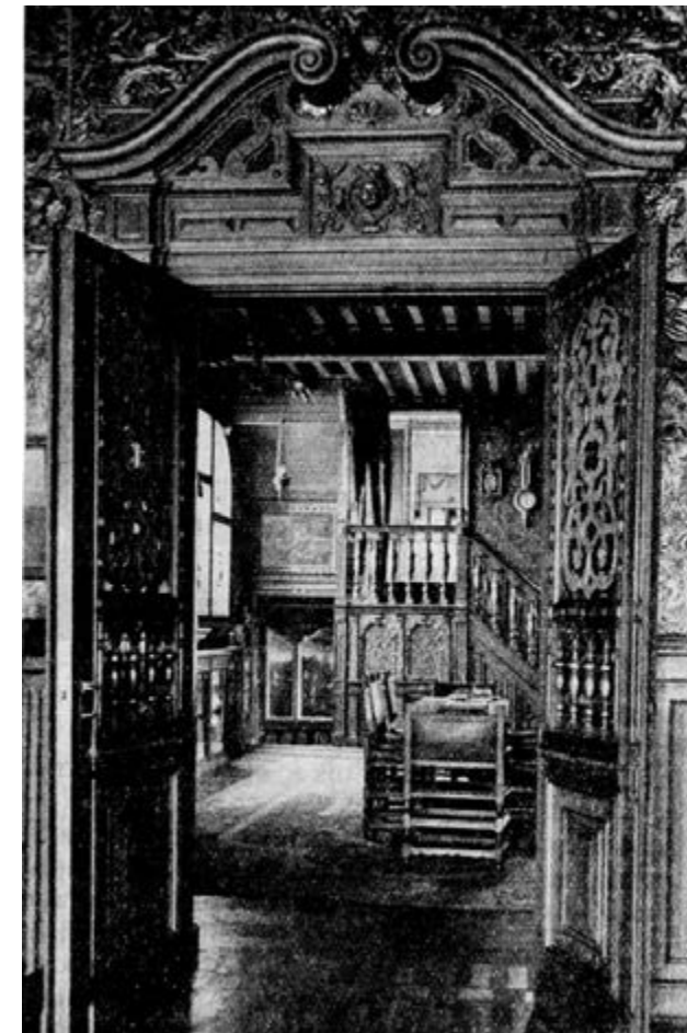
FIG. 8 Museum Mayer van den Bergh, Antwerp, Salle V (the Library) on the second floor, seen from Salle VI (La Grande Salle) , First half of the twentieth century, Photograph: anonymous, Universiteitsbibliotheek Ghent, BRKZ. TOPO.1062.E.14