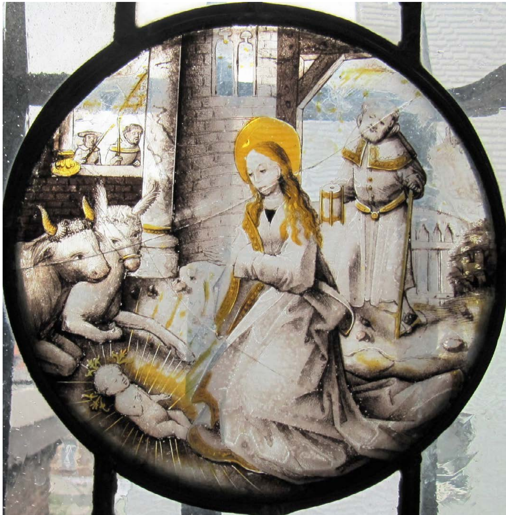
FIG. 1 Nativity , Southern Low Countries, Early 16th century, Ø 20,3 cm, inv. no. 636, Photograph: Ulrike Müller, © Museum Mayer van den Bergh, Antwerp