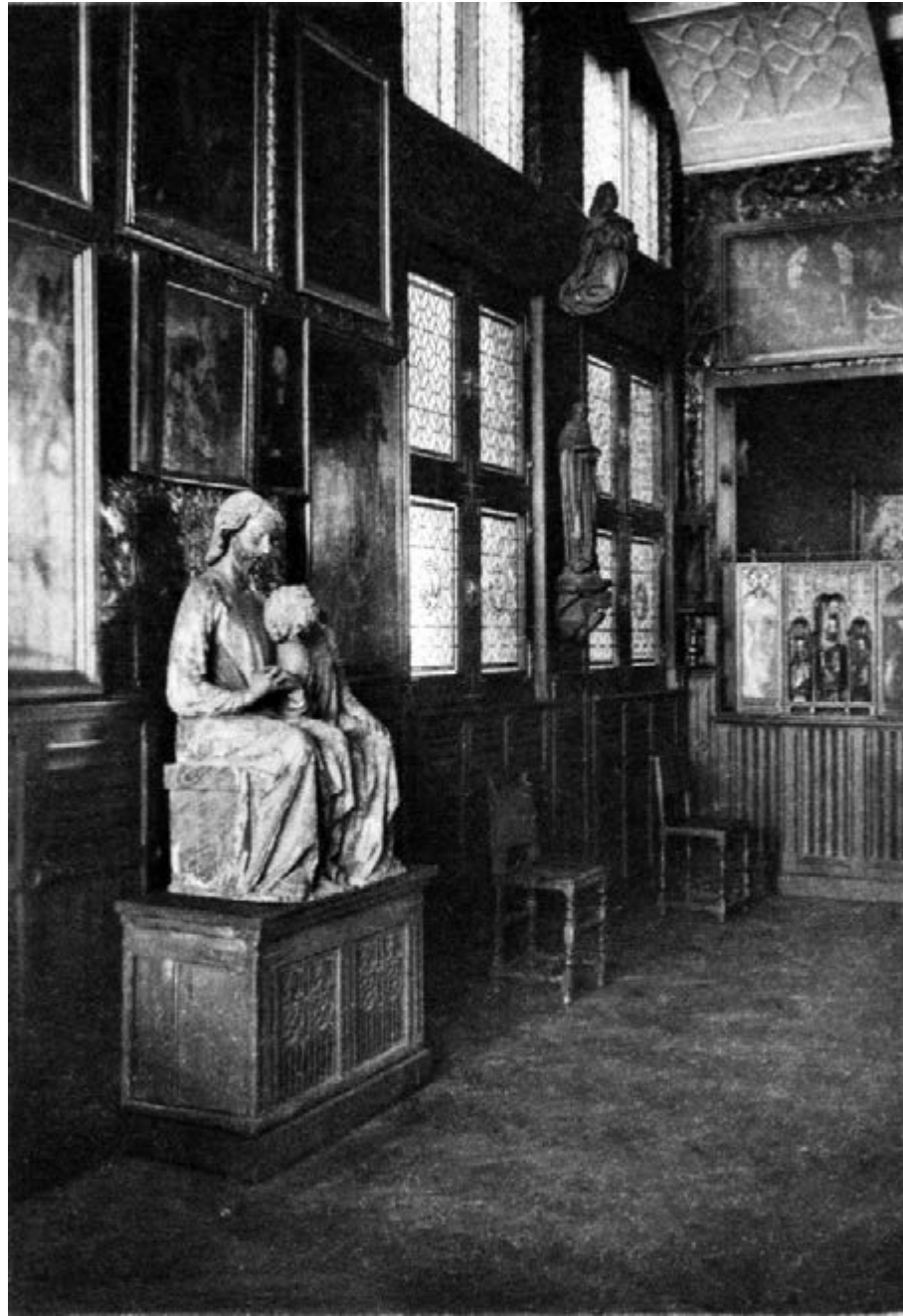
FIG. 3 Museum Mayer van den Bergh, Antwerp, Salle II on the ground floor (today Baroque Hall), First half of the twentieth century, Photograph: anonymous, Universiteitsbibliotheek Ghent, BRKZ.TOPO.1062.E.06