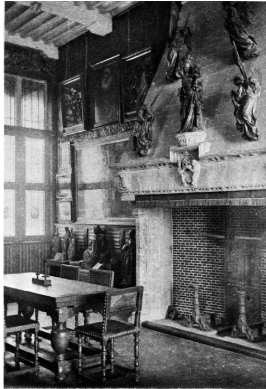
FIG. 4 Museum Mayer van den Bergh, Antwerp, Salle II on the ground floor (today Baroque Hall), First half of the twentieth century, Photograph: anonymous, Universiteitsbibliotheek Ghent, BRKZ.TOPO.1062.E.07