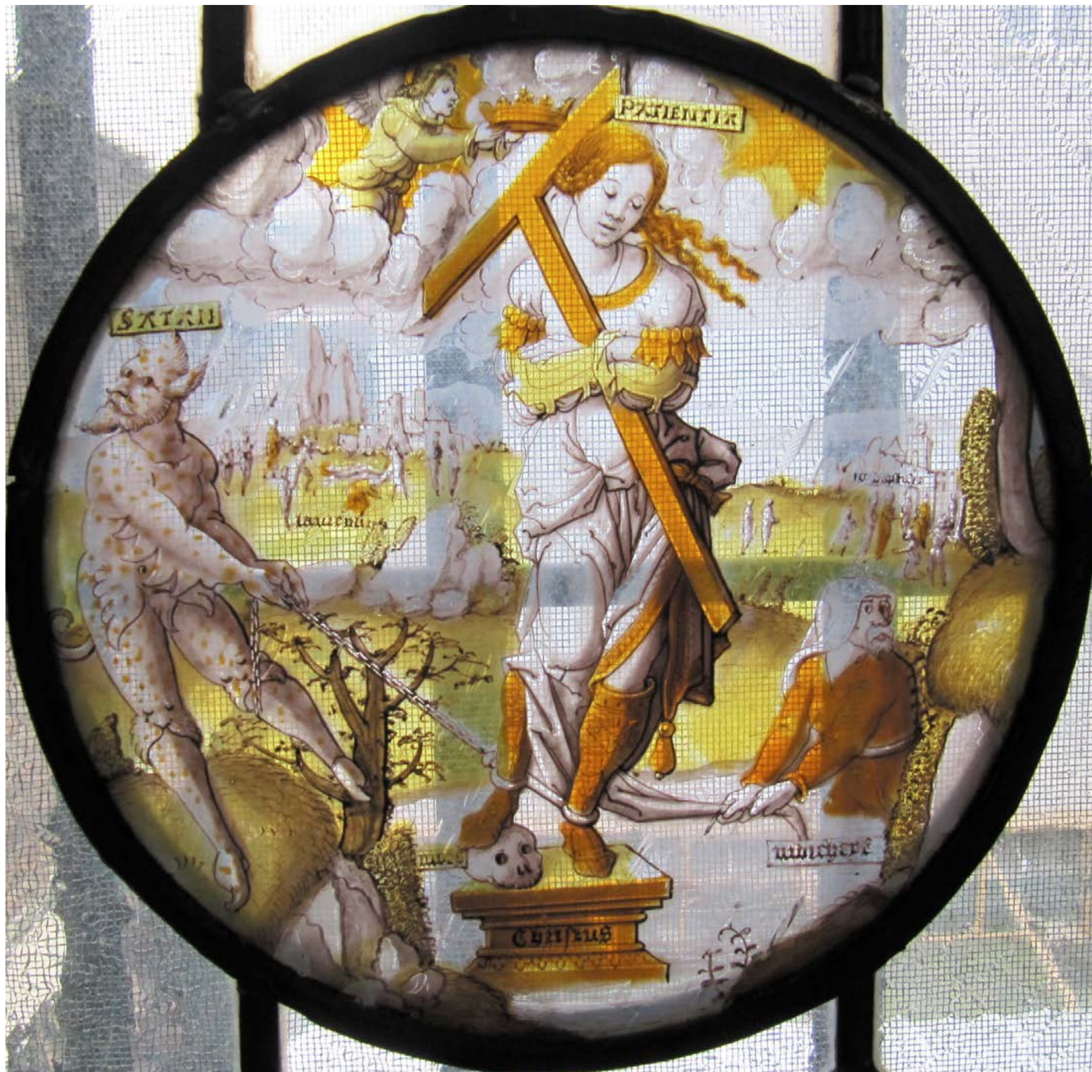
FIG. 2 Allegory of Patience , Southern Low Countries, First half of the 16th century, Ø 20,2 cm, inv. no. 654, Photograph: Ulrike Müller, © Museum Mayer van den Bergh, Antwerp