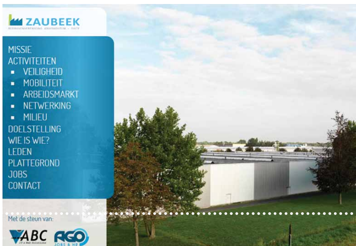
De Zaubeeek vzw website homepage