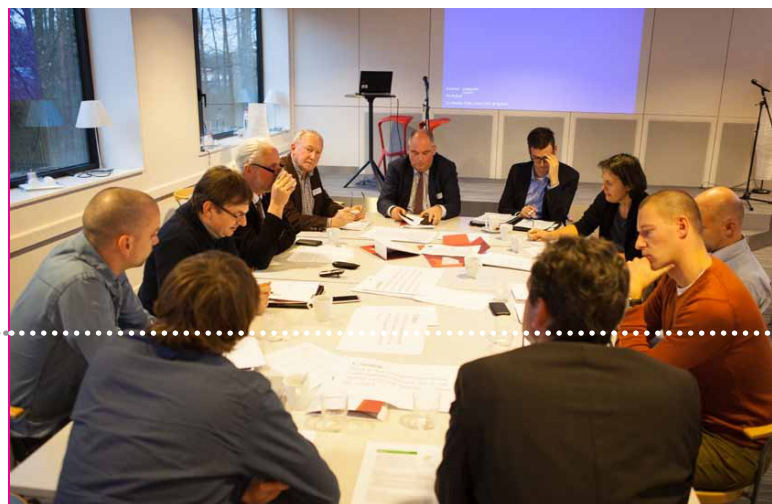
SAFE-ICE actors workshop on sustainable business park management