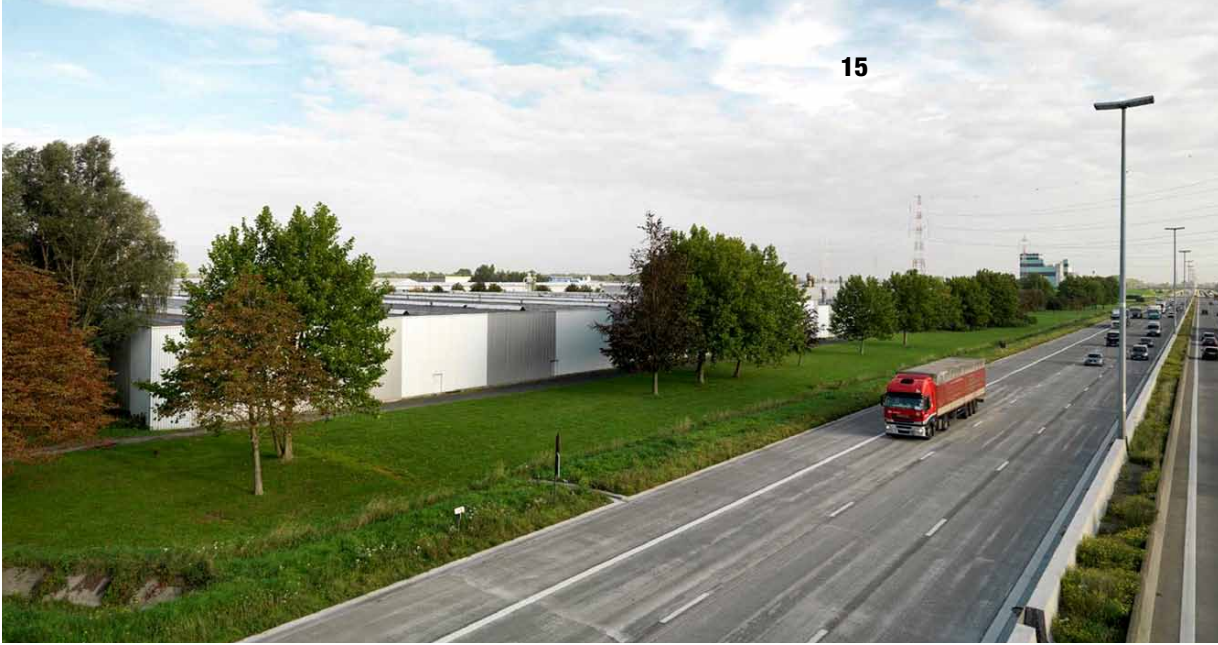
De Zaubeeek business park, view from the E17

Next to the power cooperative, De Zaubeeek vzw was created. The business association is responsible for all the communication between the local authorities and the business park. Since this association exists the interactions have greatly improved, leading to a better cooperation and coordination of the different players. A few years ago, the vzw started organising the waste collection for companies located in the business park. Thanks to the wider communication with the local communities now this initiative is growing with the aim of extending the service to all companies located within the two neighbouring municipalities. Another initiative taken by the association has been that of investing some money in planting trees in a public space as green belt between the zone and the housing areas.