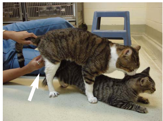
Figure 1. Sperm collection in a tomcat using an artificial vagina. The trained male mounts the queen in heat, fixing her in the neck while an artificial vagina is inserted over the penis to collect the sperm (see arrow).

The tomcat is anesthetized by using medetomidine (80-100 µg/kg IM) and ketamine (5 mg/kg IM) (Platz and Seager, 1978). After the removal of feces a probe with 3 electrodes is inserted 6 to 8 cm into the rectum